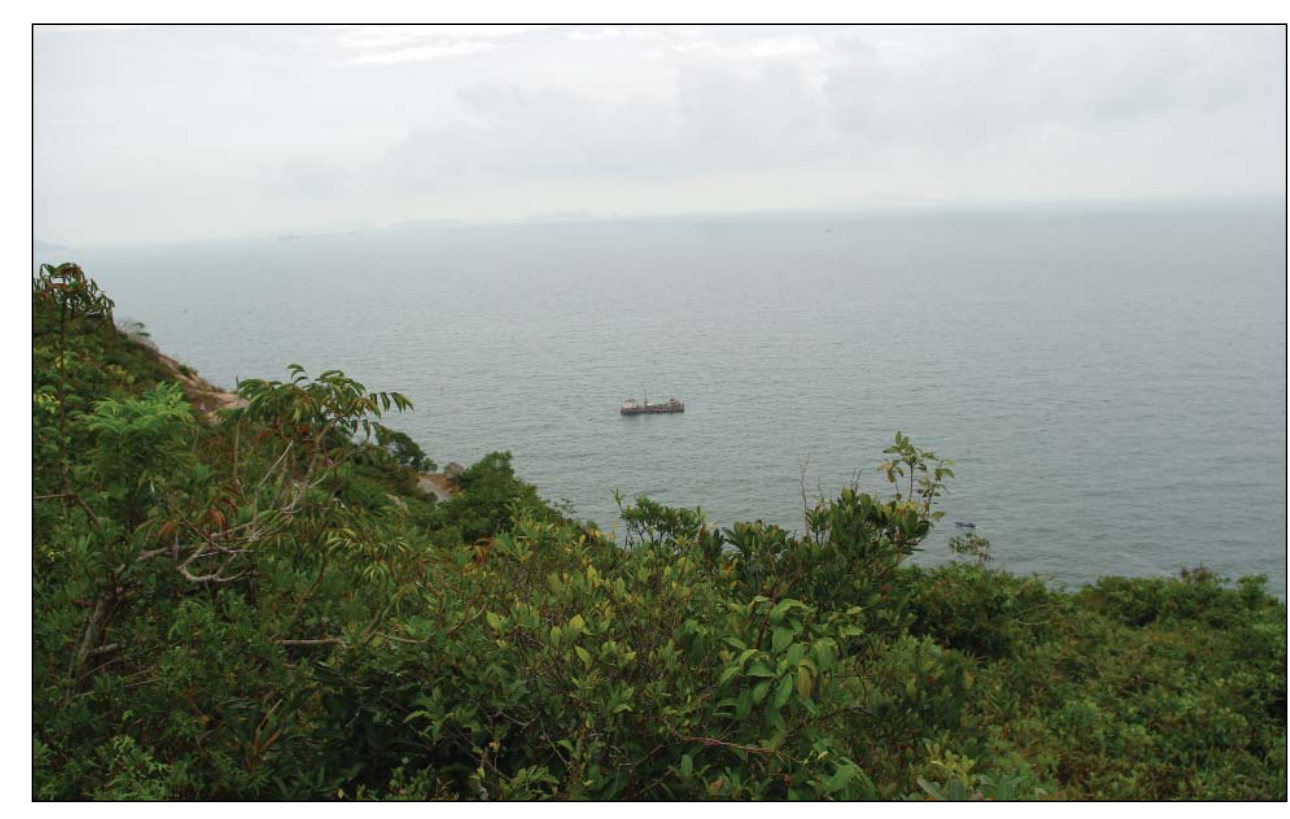
LR3 - SEAWATER