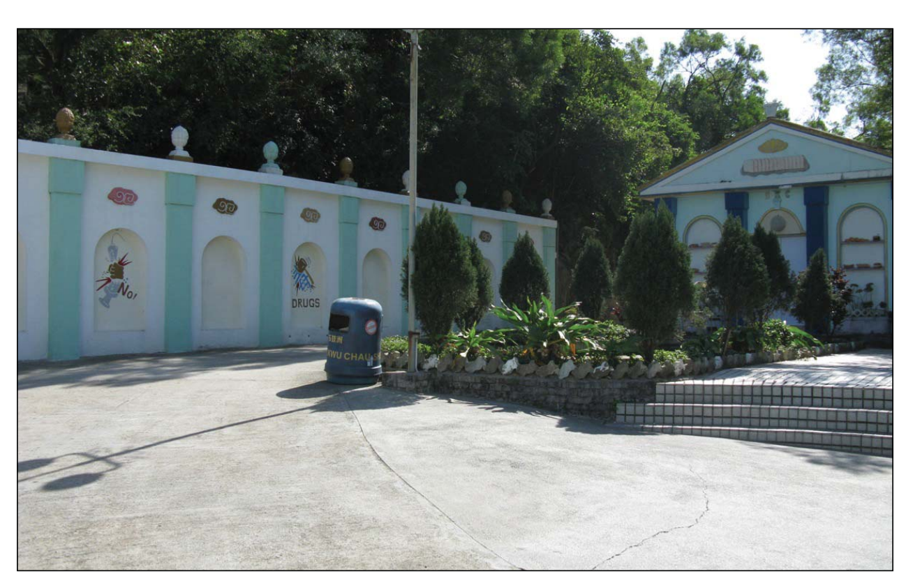
LR4 - DEVELOPED AREA