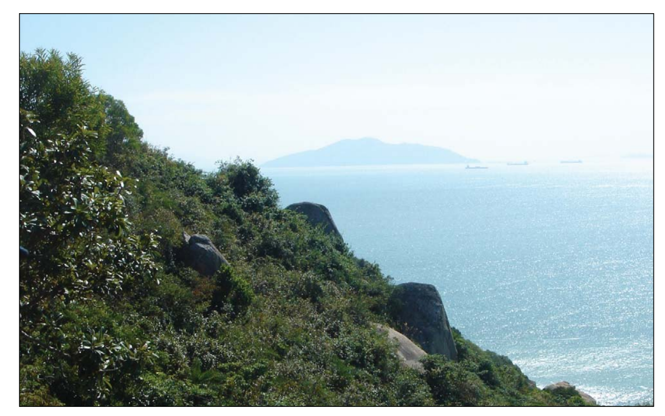
LR1 - HILLSIDE & VEGETATED SLOPE