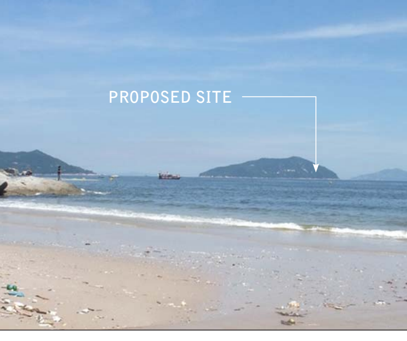
VSR5 - CHEUNG SHA, SOUTH LANTAU ISLAND