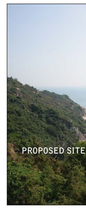
VSR3 - ADMIN BUI