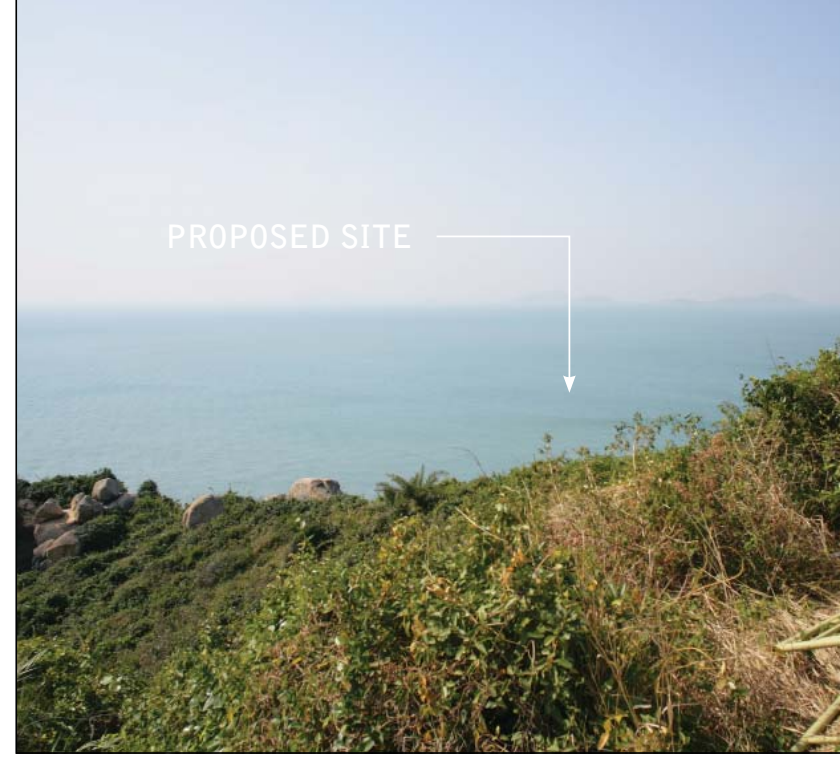
VSR2 - SHUN HOUSE