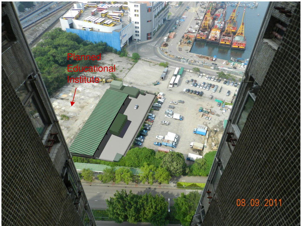
Day 1 of Operation