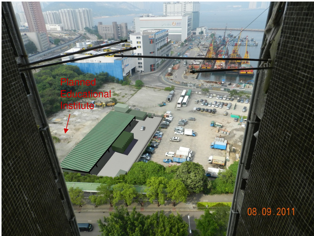
Day 1 of Operation