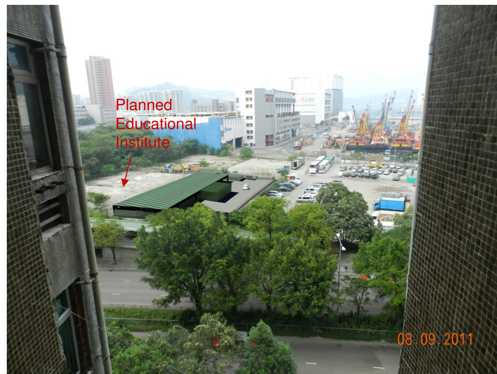
Day 1 of Operation