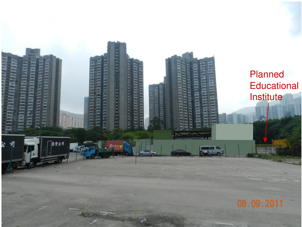
Day 1 of Operation