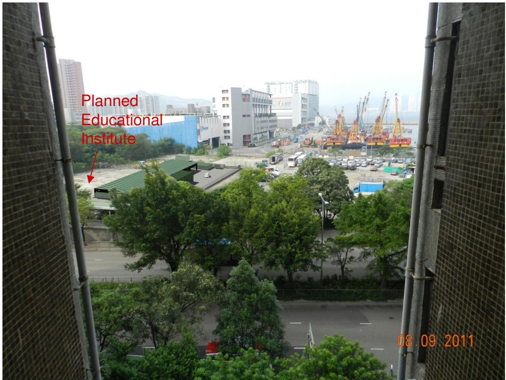
Day 1 of Operation