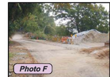
Existing Road Condition at Section 3 - 3 Chainage 0+900 to 1+085