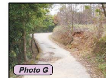
Existing Road Condition at Section 4 - 4 Chainage 1+118 to 1+230