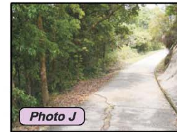
Existing Road Condition at Section 5 - 5 Chainage 1+230 to 1+640