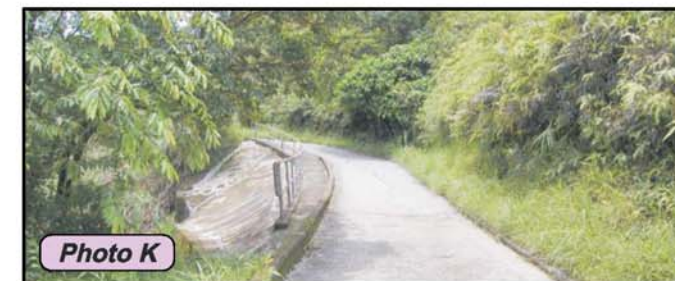
Existing Road Condition at Section 6 - 6 Chainage 1+640 to 1+670