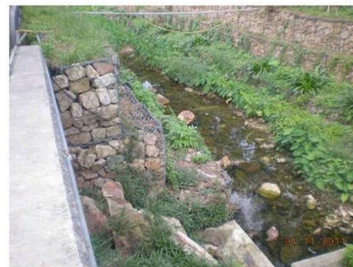
LDR 2.1 OPEN DRAINAGE CHANNELS