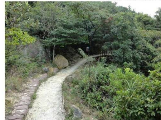
LDR 3.3 HILLSLOPES OF NEI LAK SHAN