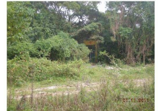
LDR 6.1 UNMAINTAINED VILLAGE SCRUB