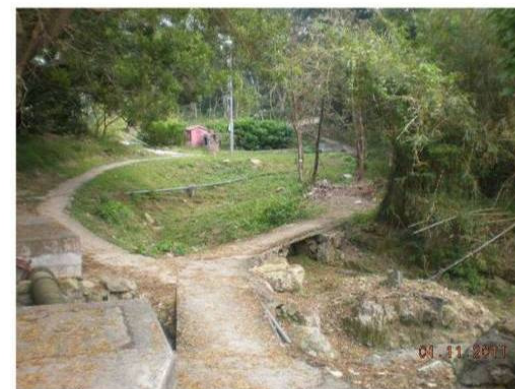
LDR 2.2 UNDERGROUND DRAINAGE CHANNELS