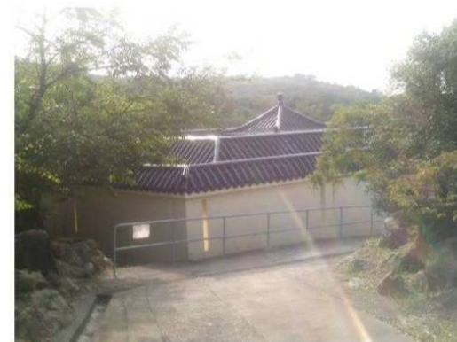
LDR 8.3 NGONG PING COLUMBARIUM