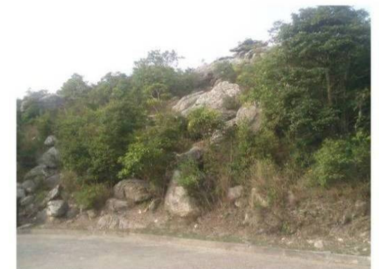
LDR 3.1 ROCKY OUTCROPS SURROUNDING NGONG PING COLUMBARIUM