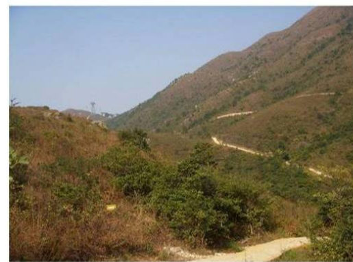
LDR 9.4 HIKING PATHS OF NEI LAK SHAN