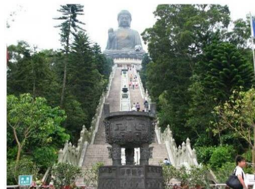
LDR 9.3 TIAN TAN BUDDHA