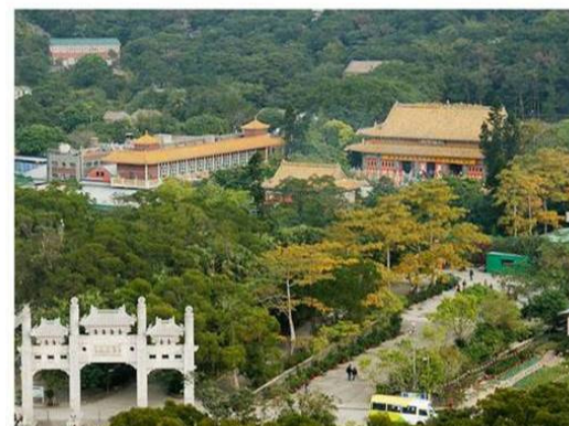
LDR 8.1 PO LIN MONASTERY