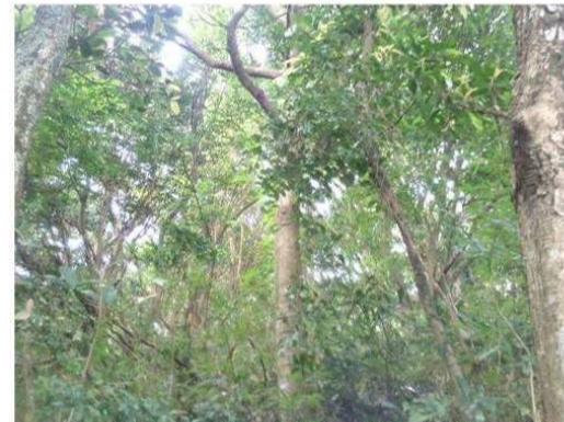
LDR 4.1 NATURALISED HILLSIDE WOODLAND