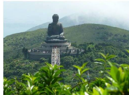
LDR 3.2 HILLOCKS SURROUNDING TIAN TAN STATUE