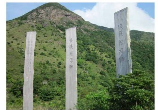
LDR 9.5 TOURIST FACILITIES AROUND TIAN TAN BUDDHA