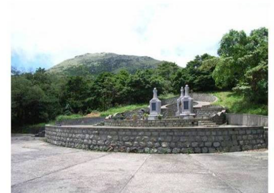
LDR 8.4 HILLSIDE GRAVE SITES