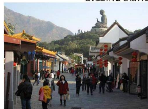
LDR 9.1 NGONG PING THEMED VILLAGE