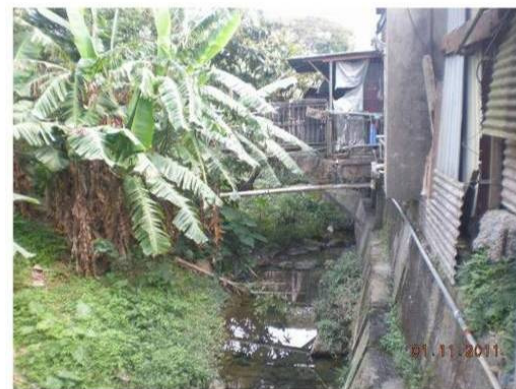
LDR 1.2 WATER COURSES THROUGH NGONG PING VALLEY