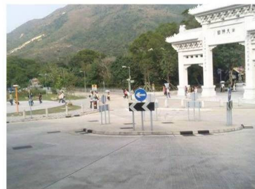
LDR 9.2 NGONG PING PIAZZA