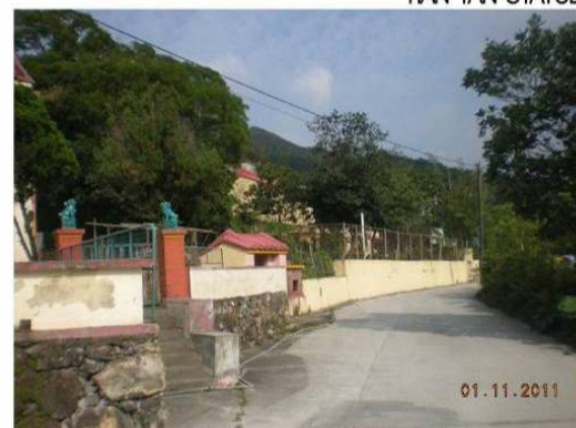
LDR 7.1 TRADITIONAL HOUSING WITH GARDEN AND ORCHARD