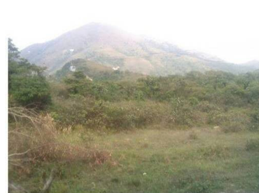
LDR 5.1 HILLSIDE GRASS AND SHRUB