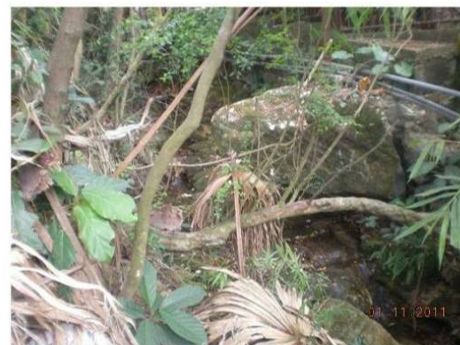
LDR 1.1 SEASONAL HILLSIDE RAVINES