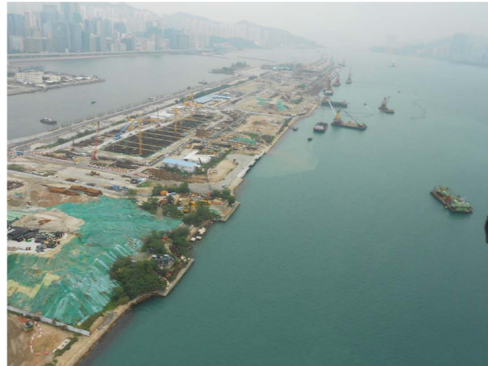
PHOTO WITH AERIAL VIEW TO THE RUNWAY