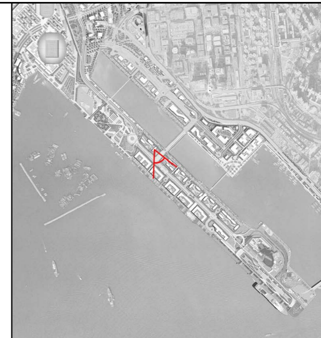
KEY PLAN SCALE N.T.S.