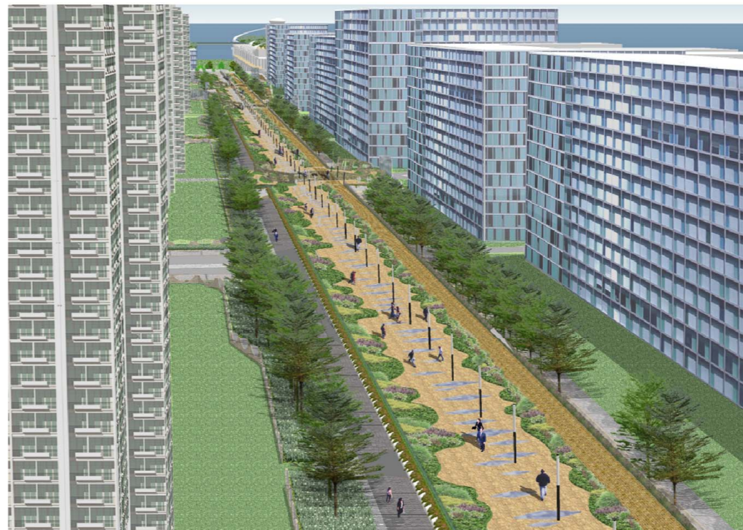
YEAR 10 WITH MITIGATION MEASURES

Disclaimer: The future Kai Tak Development does not form part of the Project and is not for approval under this EIA submission.