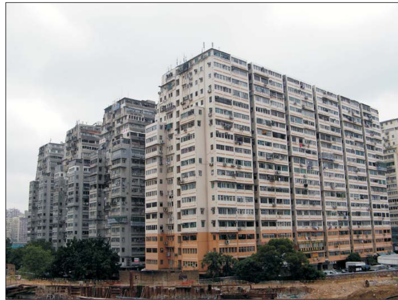
R1.9 Man Cheong Building