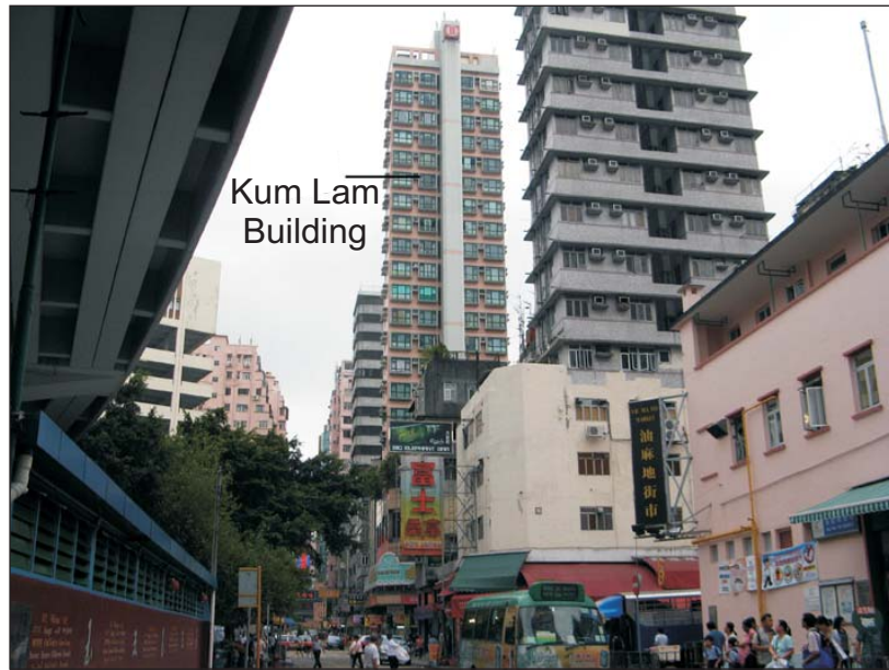
Kum Lam Building