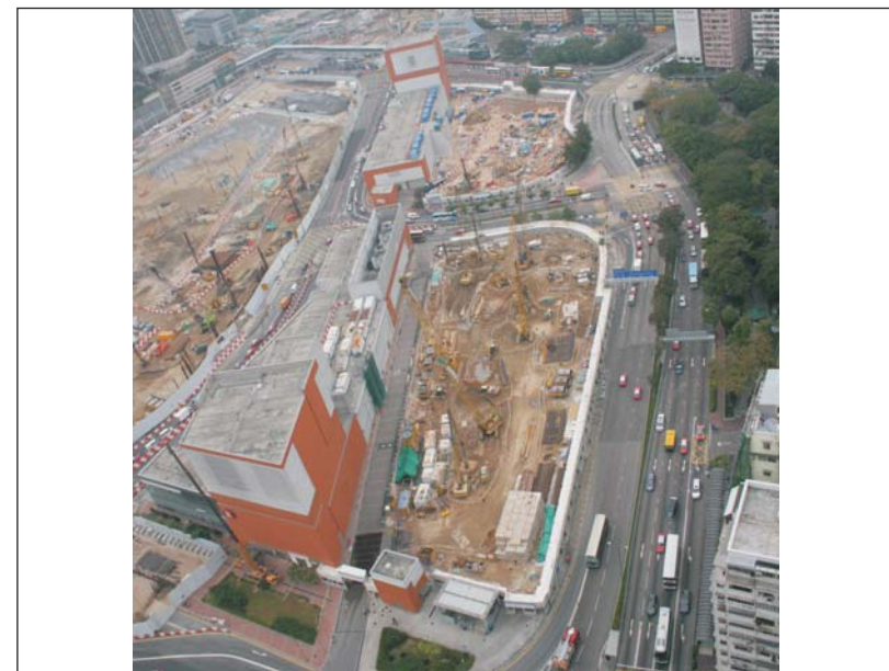
R1.12 Planned Residential Development above Austin Station