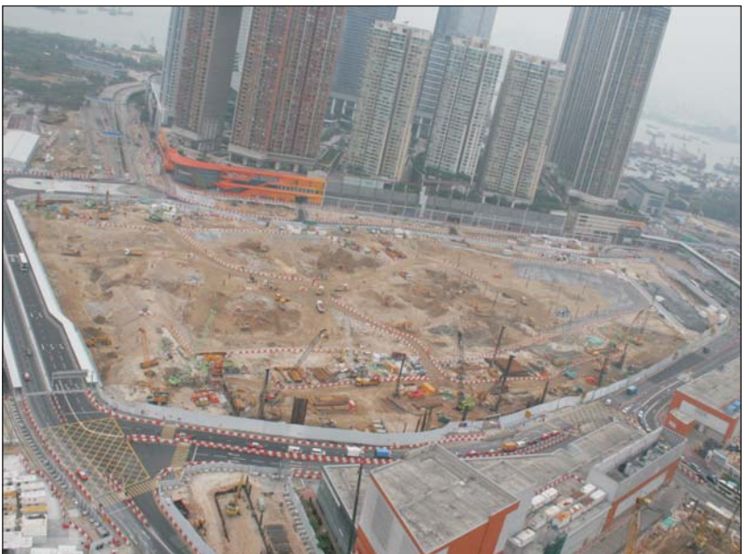
C1.5 Planned Commercial Development above XRL Terminus C1.6 Keybond Commercial Building