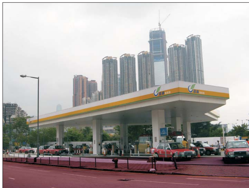
O1.1 LPG Filling Station at Hau Cheung Street