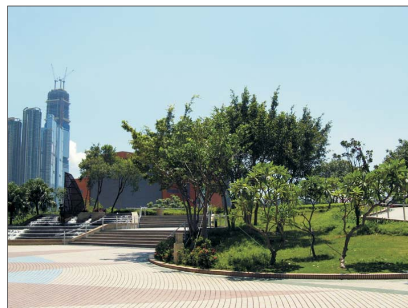
RE1.1 Olympic Plaza