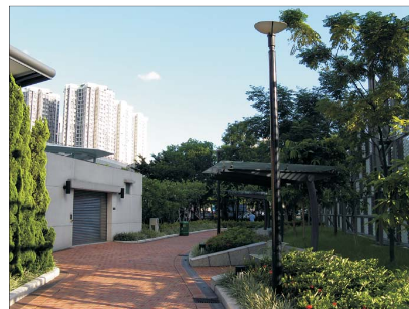
RE1.2 Cherry Street Park