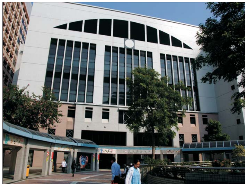
GIC1.7 Queen Elizabeth Hospital