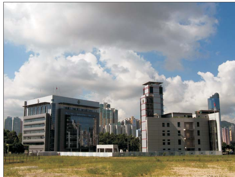
GIC1.8 Civil Aid Services Headquarter