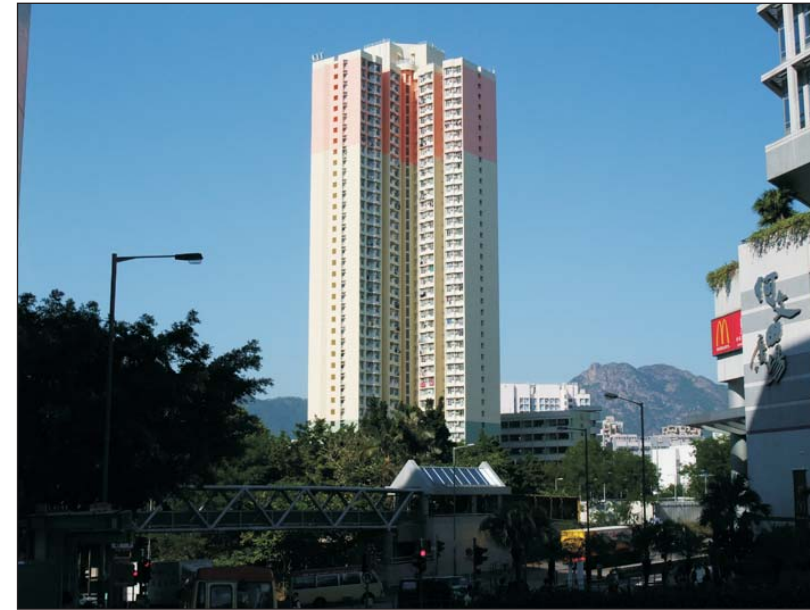
R2.3 Ho Man Tin Estate King Man House