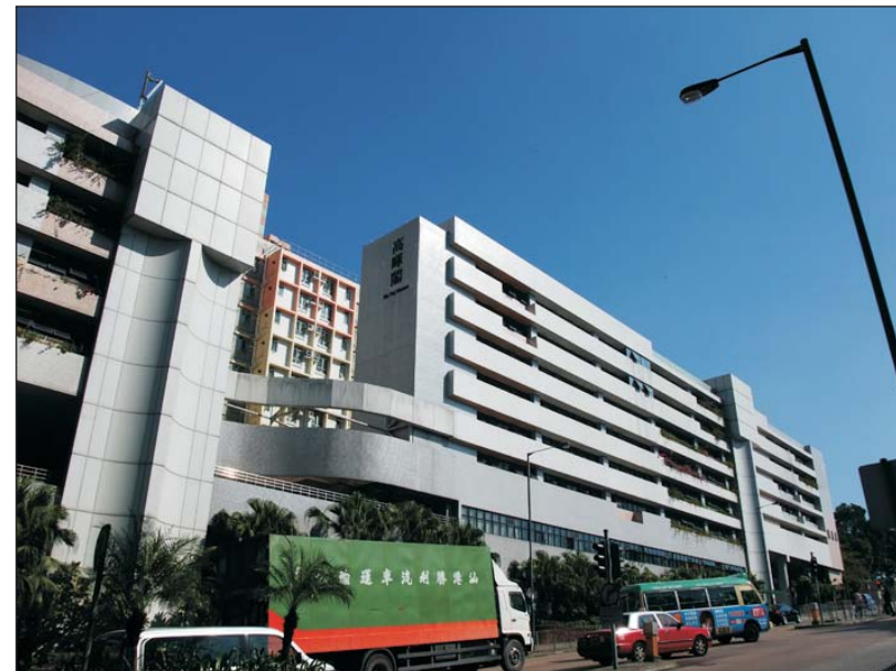
R2.5 Ho Man Tin Estate