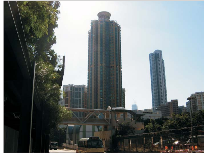
R2.2 Ellery Terrace