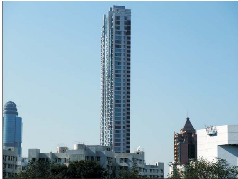
R2.1 15 Ho Man Tin Hill