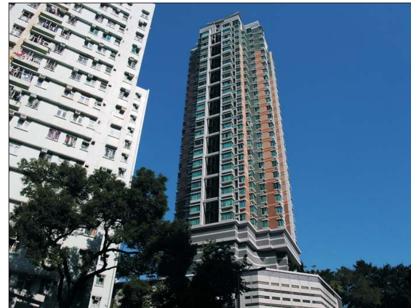
R2.6 Carmel On The Hill