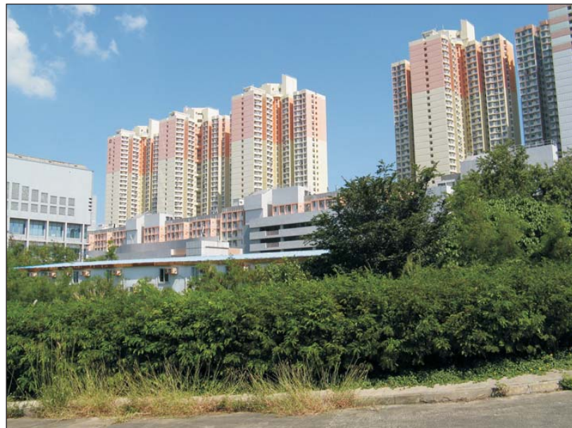
R2.4 Ho Man Tin Estate (High Rise Building Block)