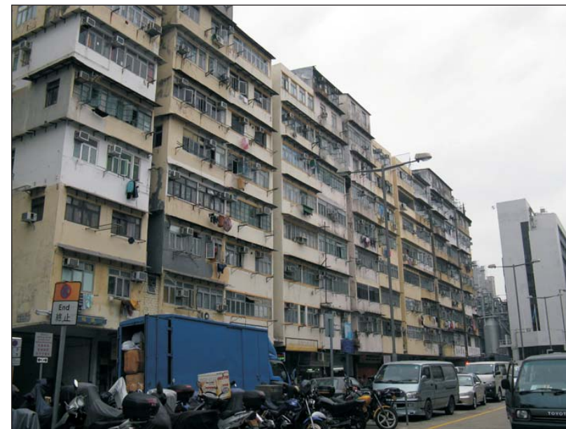
CR3.1 Comprehensive Development Area around Ma Tau Kok Road (photograph at Hing Yan Street)

Image for this future development is not yet available