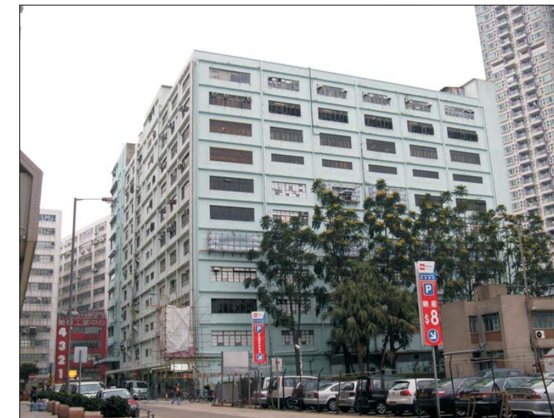
C3.2 Kapok Industrial Building