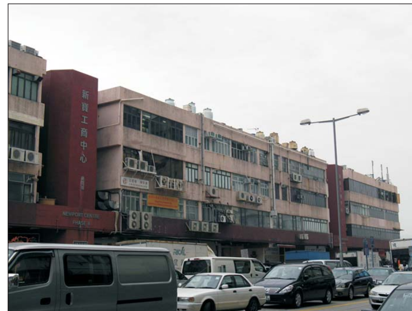
C3.1 Newport Centre