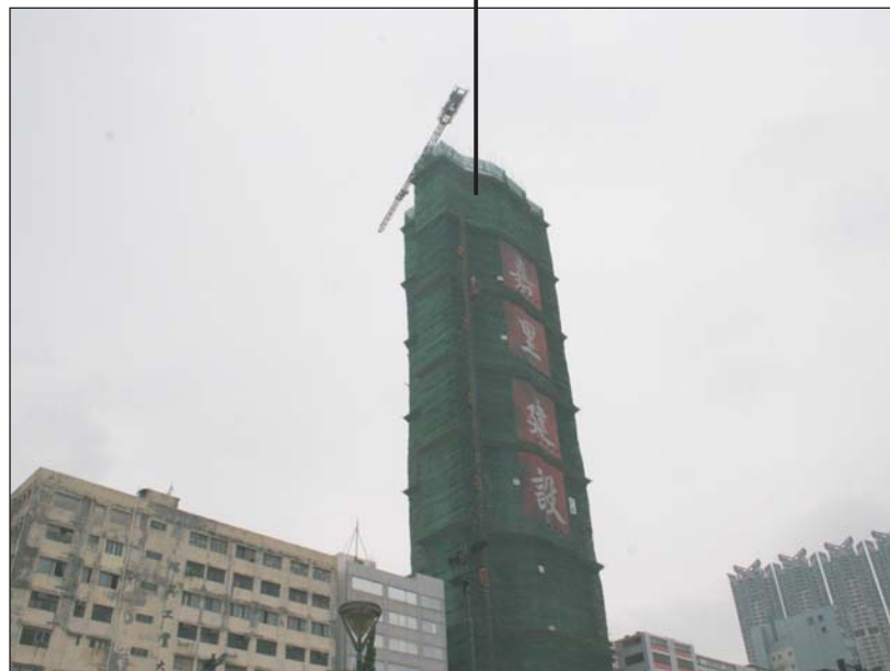
R3.9 R3.9 Sunrise Villa (and New Residential Development at 9 Yuk Yat Street)