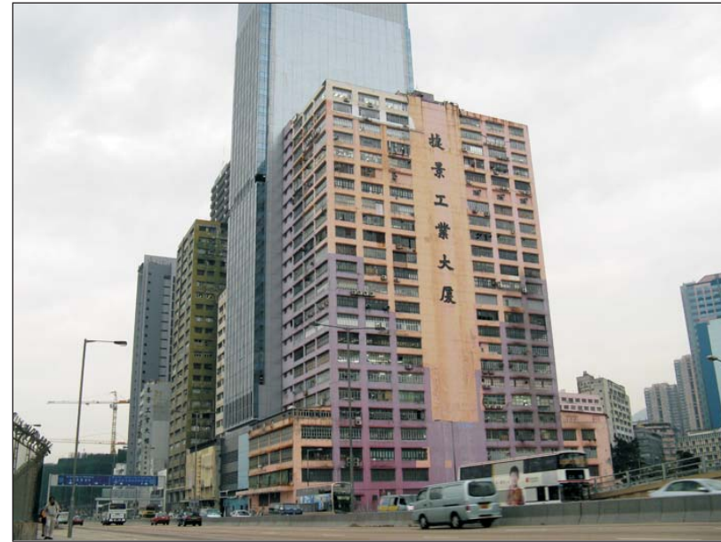
C3.4 Tai King Industrial Building