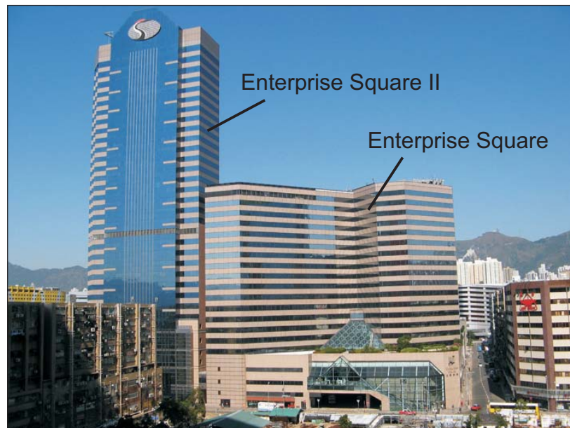
C3.6 Enterprise Square II and Enterprise Square