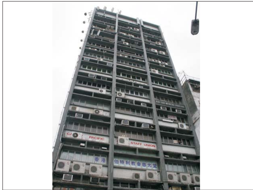
C3.3 Kam Fai Commercial Building (and Regal Oriental Hotel Hong Kong - see photo for R3.5)