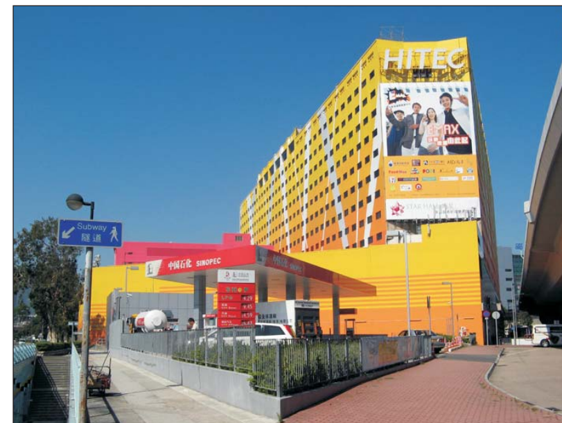
C3.8 Hong Kong International Trade and Exhibition Centre