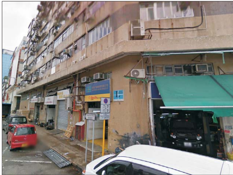
C3.14 Industrial Buildings along Wang Kee Street