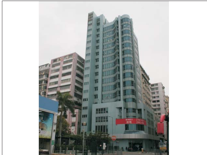
C3.10 United Daily News Centre