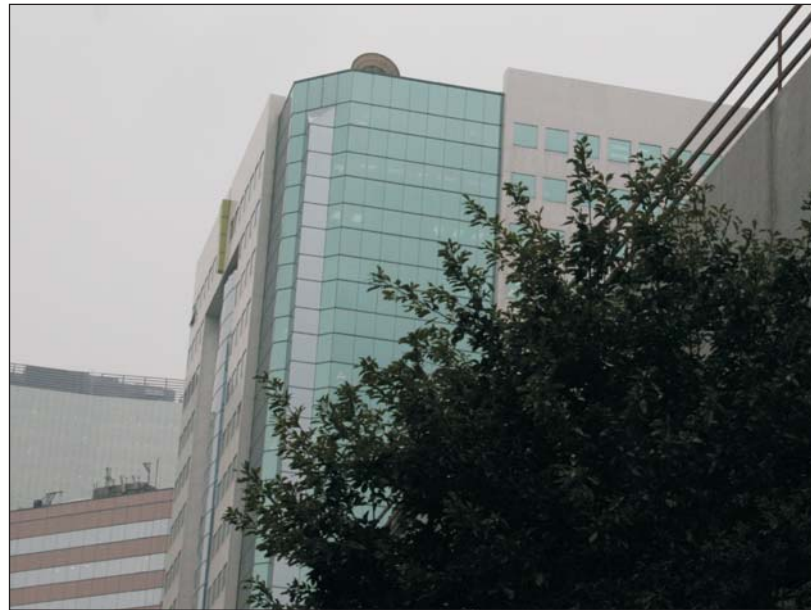
C3.13 Nam Fung Commercial Centre