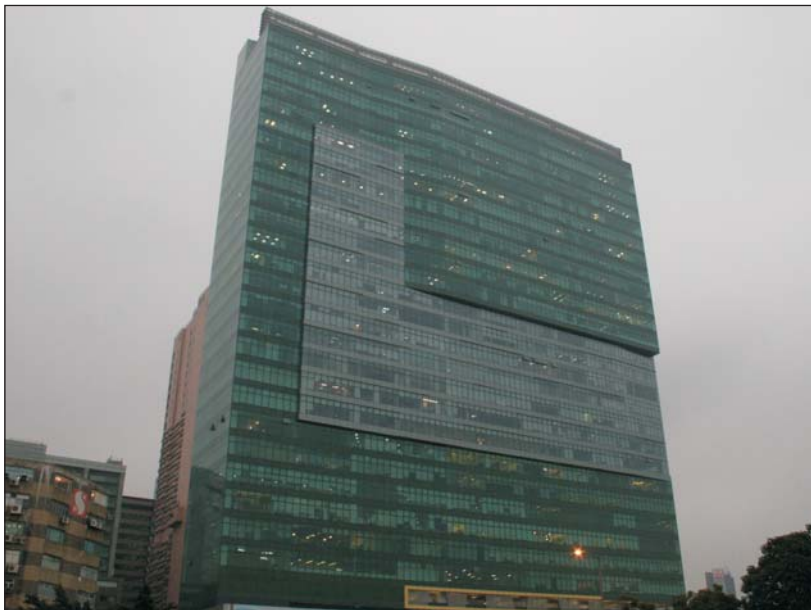
C3.12 Billion Centre