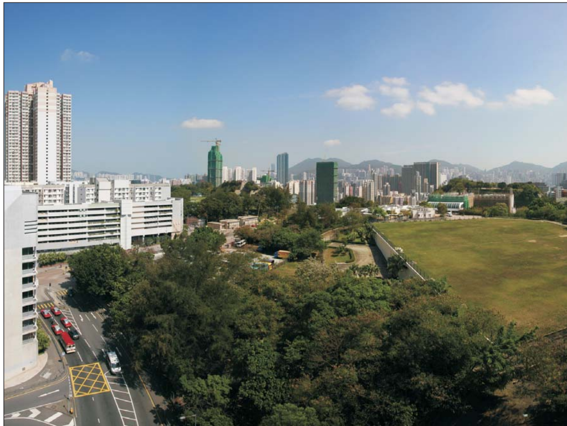
Existing Condition (at Approx.+75 mPD)