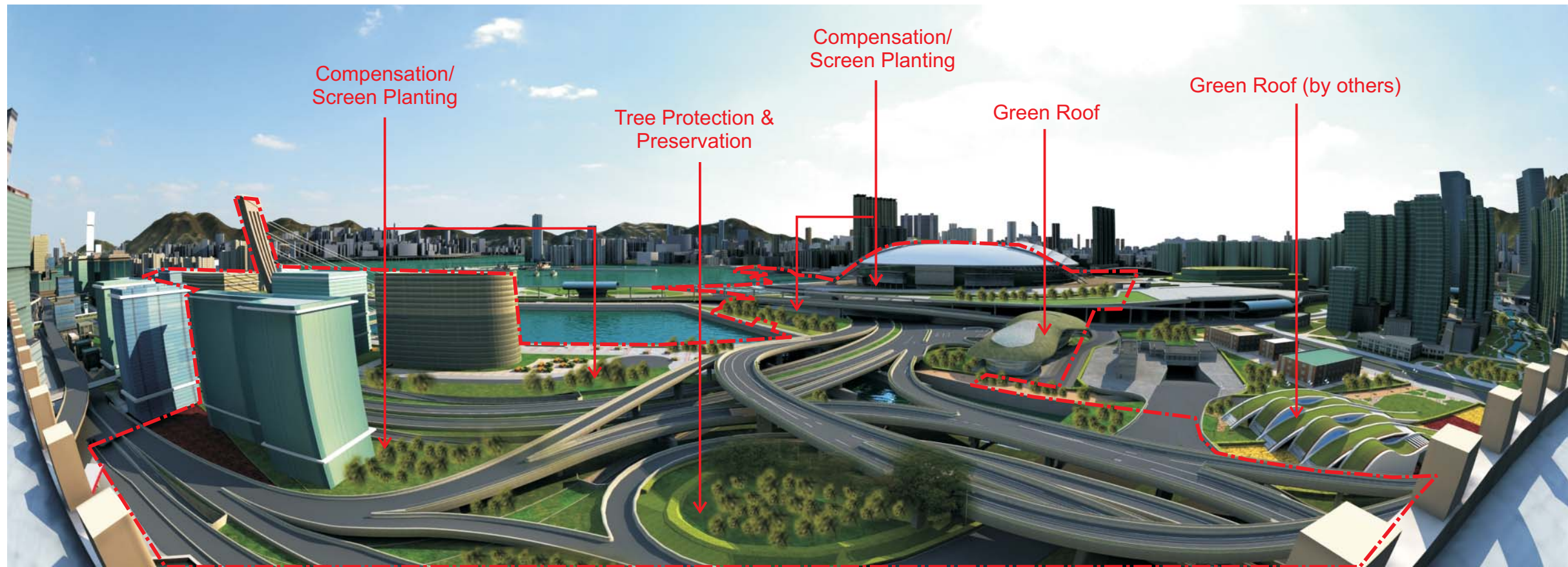
Day 1 with Mitigation Measures