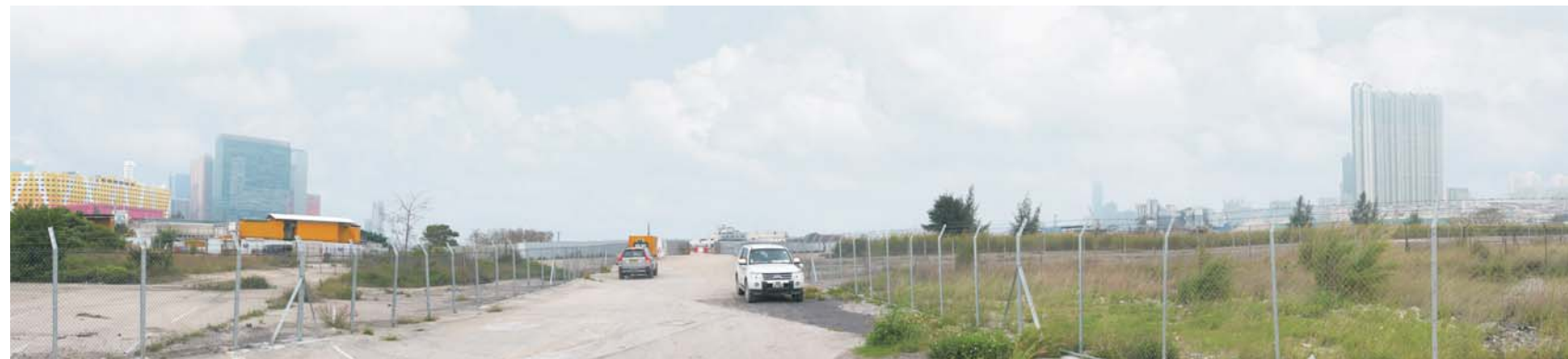
Existing Condition – From Ground Level (no high rise structures currently exist)