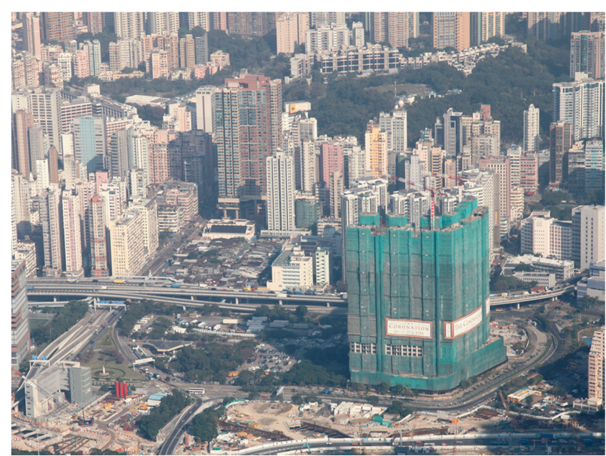
LCA 1.5 Residential Urban Landscape (West Portion)