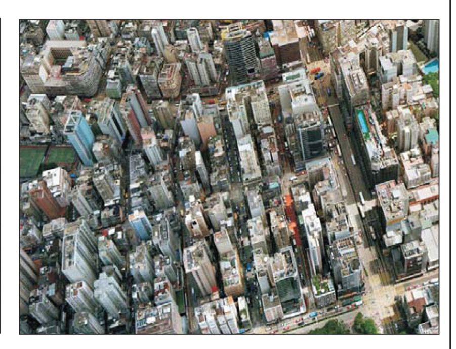
LCA1.3 City Grid Mixed Urban Landscape (West Portion)