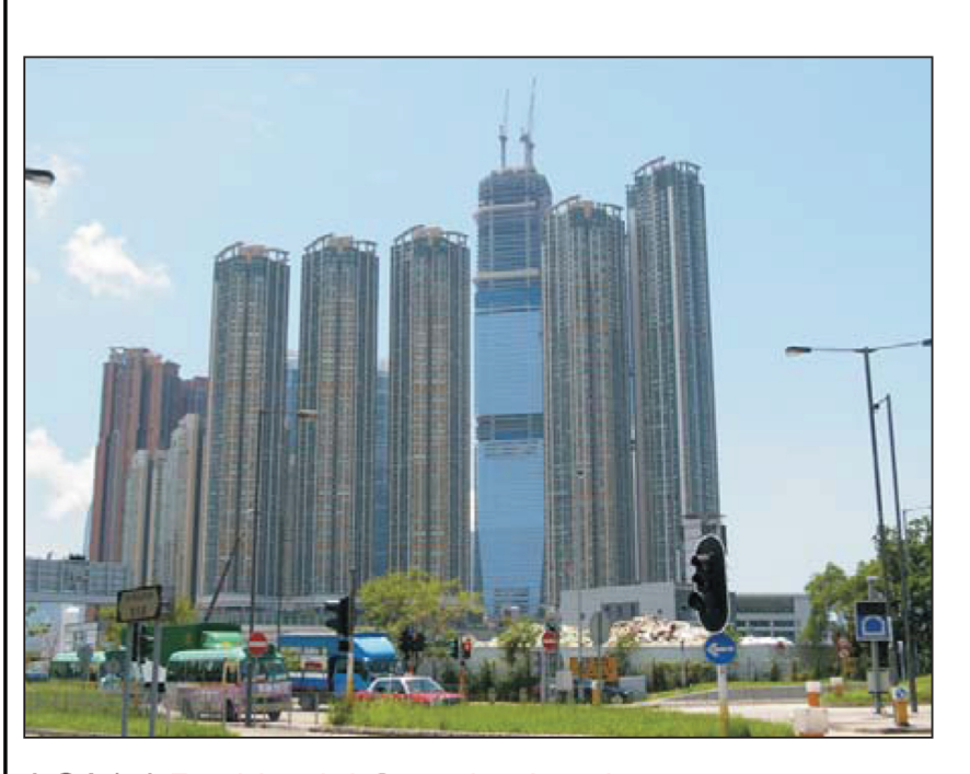
LCA1.4 Residential Complex Landscape