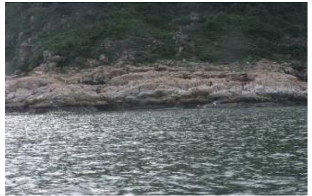
Natural Rocky Shoreline near T3