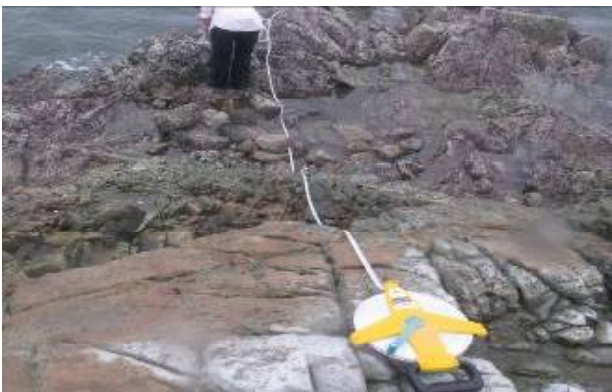
Intertidal Transect Survey at T3