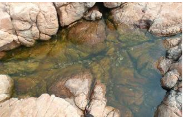
Intertidal Rock Pool