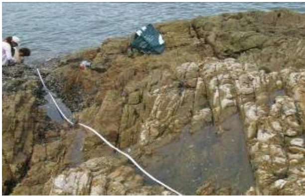
Natural Intertidal Rocky Shore at T2