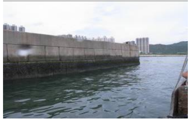
Artificial Vertical Seawall near T2