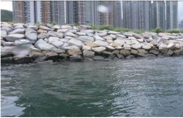
Artificial Sloping Seawall at T1