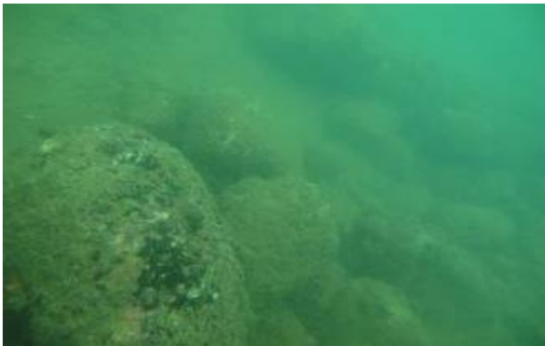
Boulders and Bedrocks Underwater