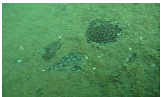
Oulastrea crispata on Bedrock and Boulder