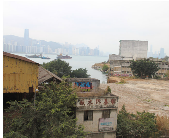
LT/LR2 Trees within Yau Tong Bay Industrial Waterfront Area