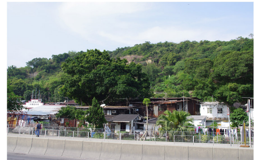
LT/LR7 Village Trees Within Cha Kwo Ling Residential Area