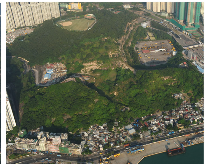
LT/LR9B Grassland/Shrubland Mosaic at Cha Kwo Ling