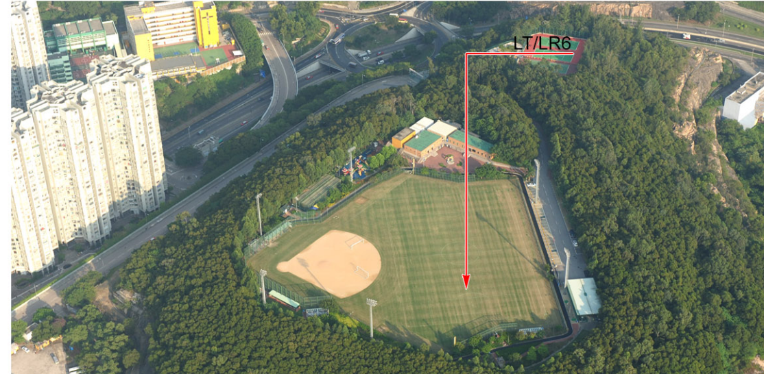
LT/LR6 Grass Sports Pitch Within Sai Tso Wan Recreation Ground