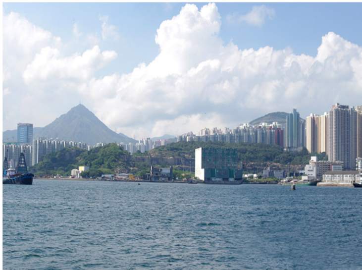
LT/LR1 Lei Yue Mun Channel Sea Waterbody