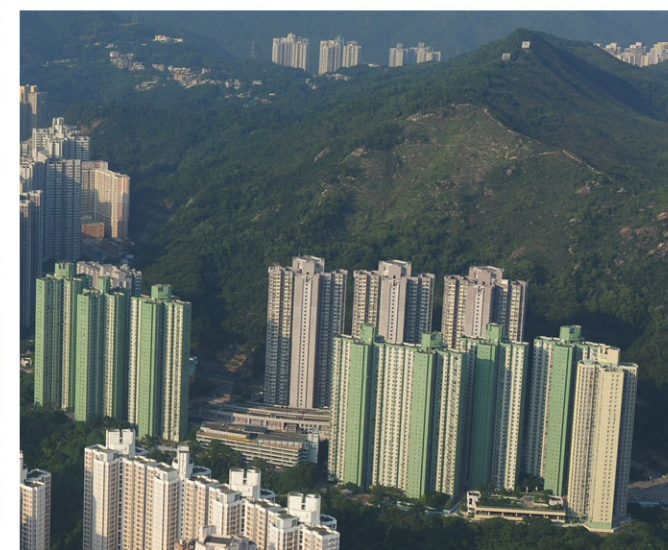
LT/LR9A Grassland/Shrubland Mosaic on Ng Kwai Shan