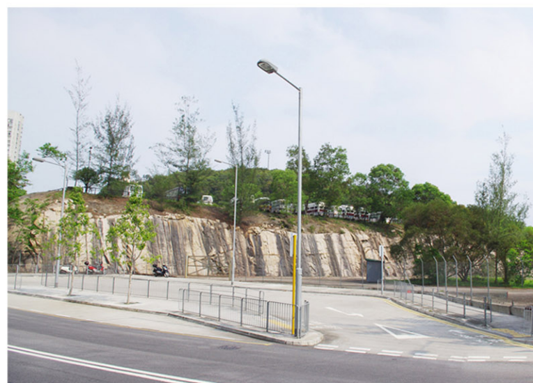
LT/LR8B Amenity/Roadside planting/Vegetation on Modified slopes Former Quarry