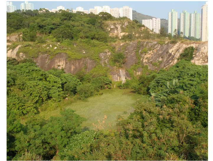
LT/LR4 Pond at Cha Kwo Ling