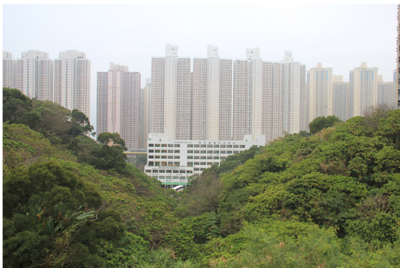
LT/LR5 Natural Watercourse