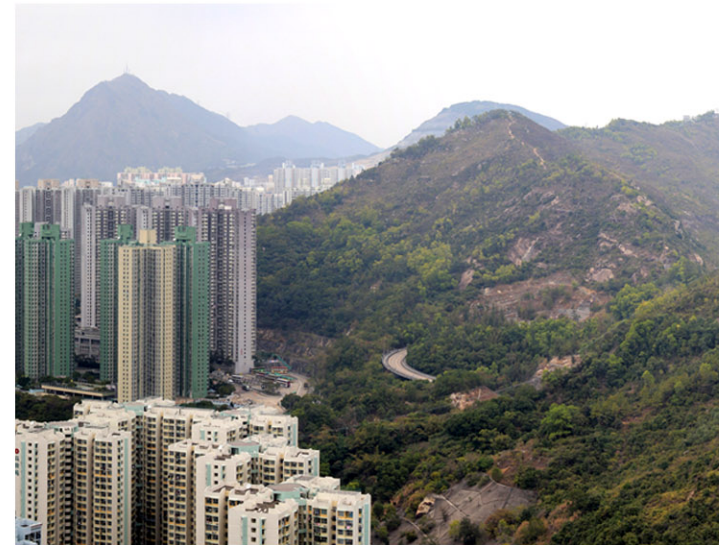
LT/LR3 Mixed Woodland Vegetation on Hillside Areas