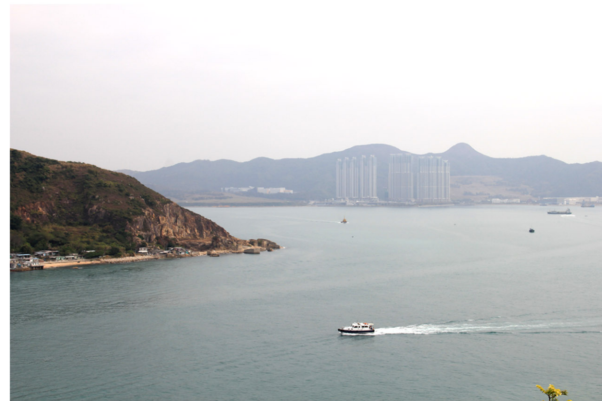
TO TKO-T2 Seaborne Leisure Travellers along Lei Yue Mun and Tathong Channel