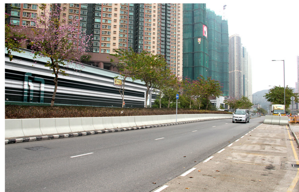
TO TKO-T4 Travellers at TKO MTR Station and along Po Yap Road and Chui Ling Road