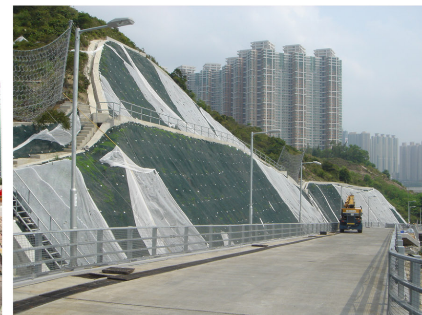
TO TKO-T5 Walkers on new footpath link from Ocean Shores to Junk Bay Chinese Permanent Cemetery