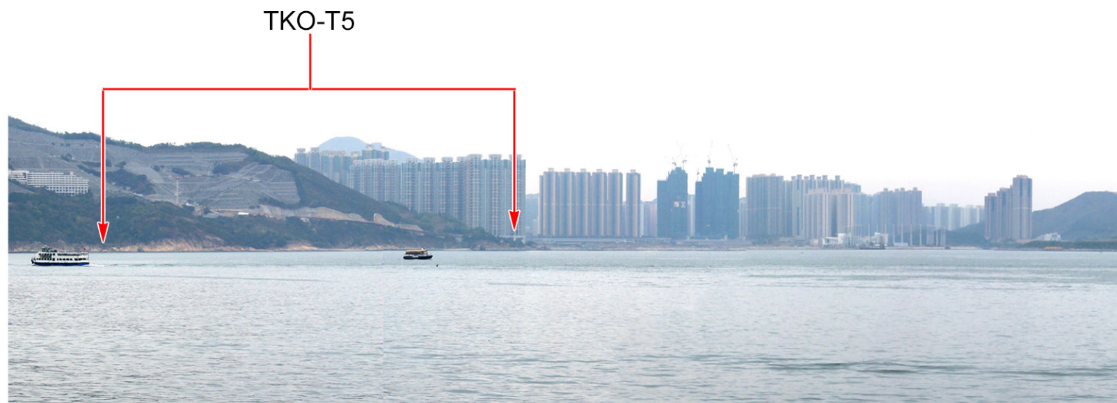
FROM TKO-T1; TO TKO-T5 Seaborne Leisure Travellers in Junk Bay