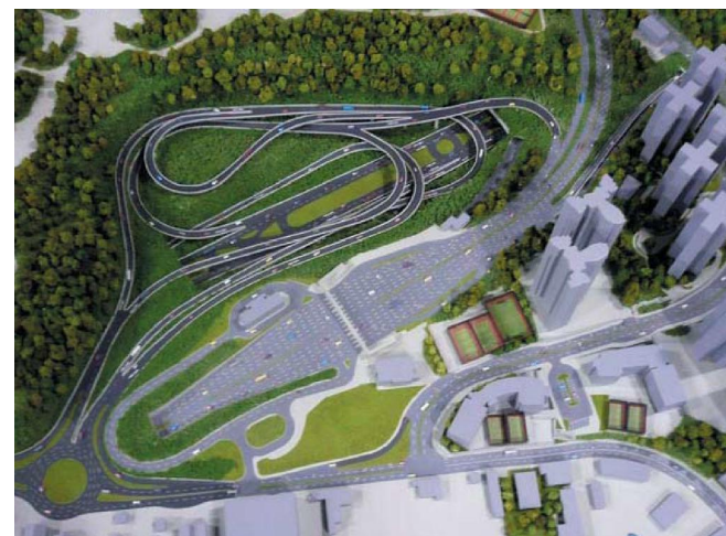
Physical Model of Tunnel Option