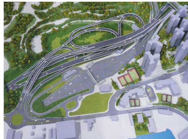
Physical Model of Depressed Road Option