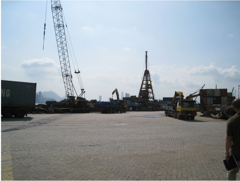
021 — Proposed Cha Kwo Ling Promenade