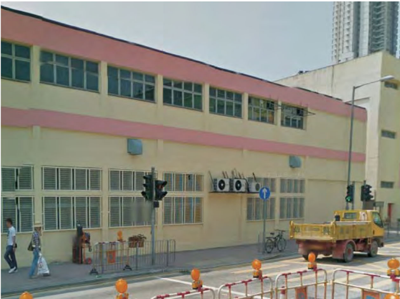
GIC1 — EMSD Workshops/Sewage Pumping Station & Electricity Substation