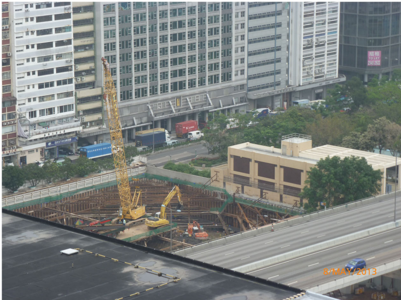
020 — Soccer Pitch, Petrol, Car Park, Filling Station & vacant Sites/Proposed Cha Kwo Ling Promenade/Park