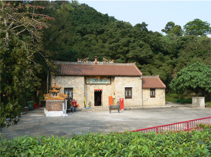
022 — Tin Hau Temple