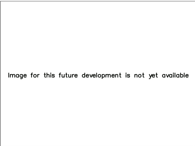
GIC3 – Tunnel Ventilation Shaft & Administration Building