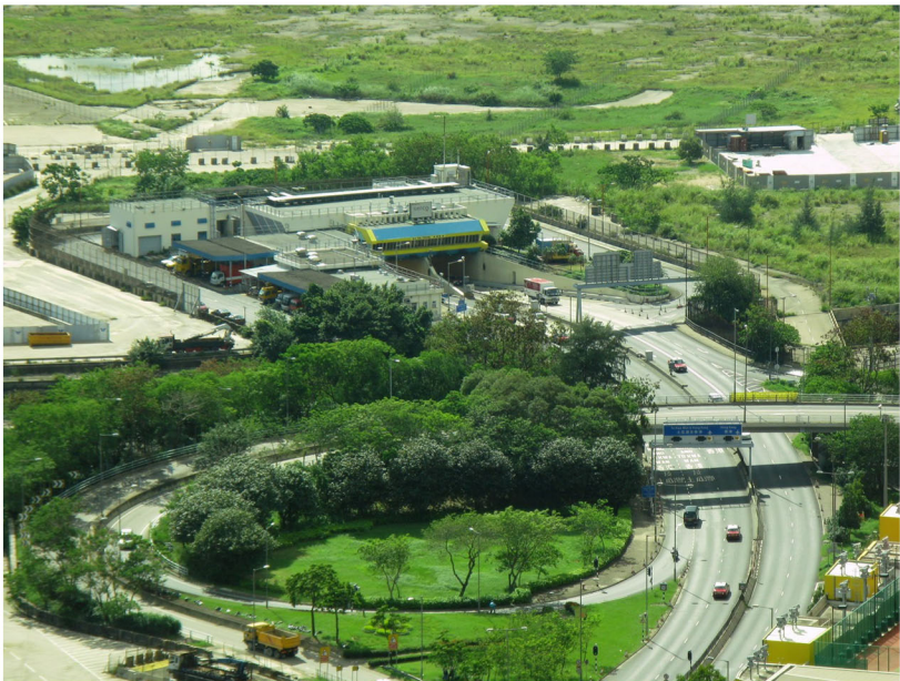
GIC4 – Tunnel Ventilation Shaft & Administration Building