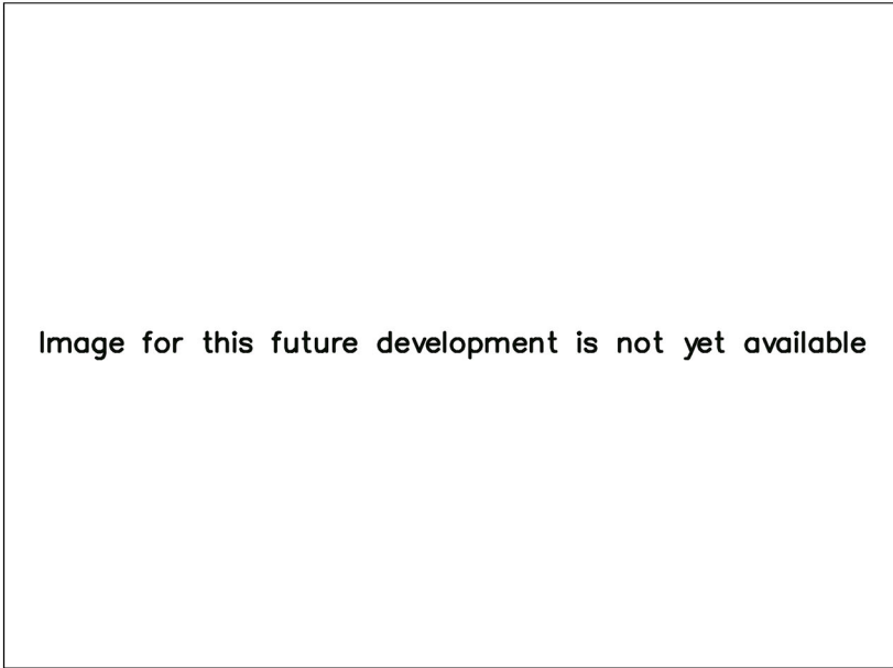
GIC7 – Southern Undesignated Government Site at former Kai Tak South Apron