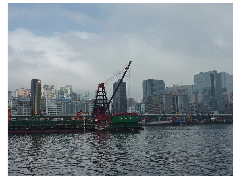
LR12 – Water Body (Kwun Tong Typhoon Shelter)