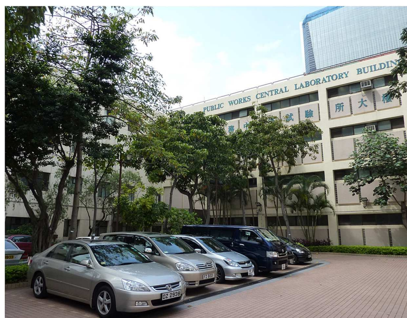
LR11 – Amenity Area (Public Works Central Laboratory)