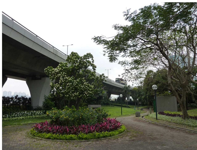
LR7 – Amenity Area (under Kwun Tong By-pass)