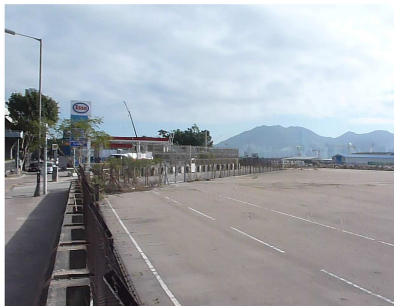
LR8 – Derelict / Disturbed Land (KTD South Apron)