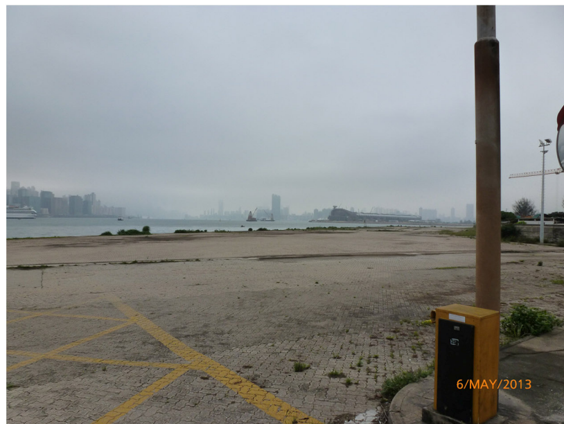
LR16 – Derelict / Disturbed Land Proposed as Cha Kwo Ling Promenade Park by Others (Cha Kwo Ling Former Public Cargo Working Area)