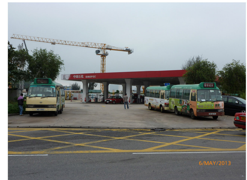
LR18 – Occupational Land (Wai Lok Street Garage)