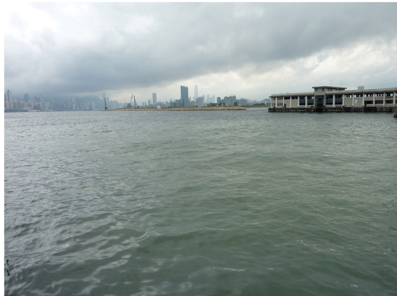
LR13 – Water Body (Victoria Harbour)