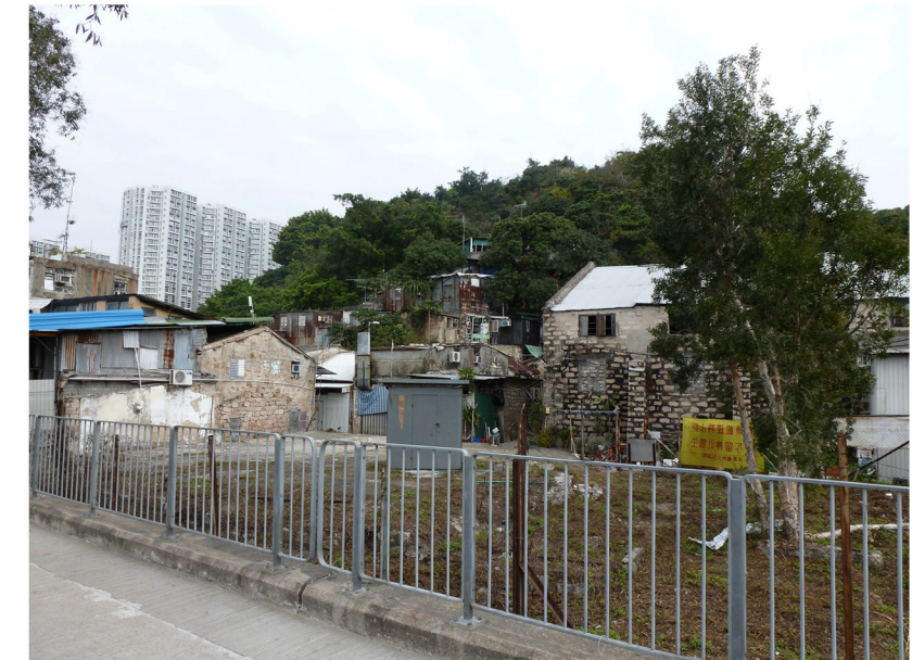
LR15 – Residential Landscape (Cha Kwo Ling Residential Area)