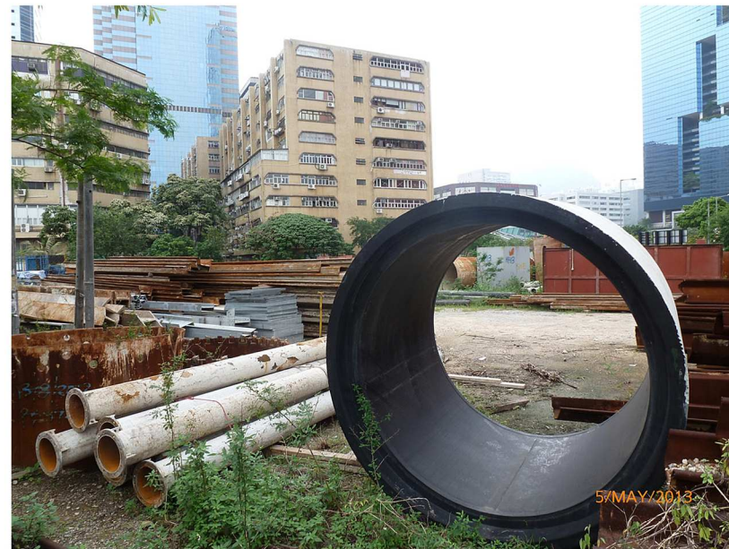
LR2 – Derelict / Disturbed Land Proposed as Open Space (Kai Fuk Road)