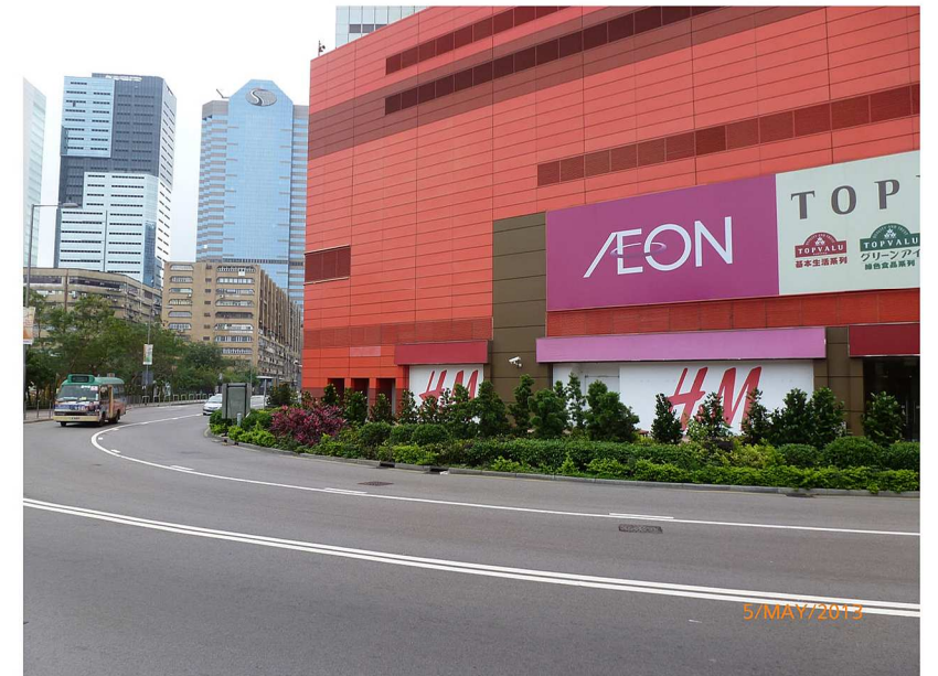
LR3 – Roadside Planting (Sheung Yee Road)