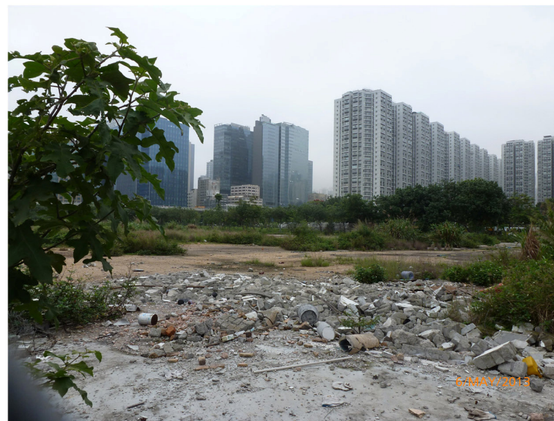
LR17 – Derelict / Disturbed Land (Wai Lok Street Reclaimed Industrial Area)