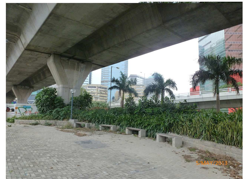
LR6 – Amenity Area with Sitting Areas and Footpath (Kai Fuk Road / Kwun Tong By-pass)