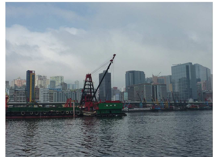
LR12 – Water Body (Kwun Tong Typhoon Shelter)