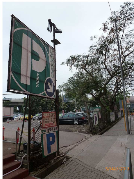
LR4 – Car Park (GW Parking Lot at Sheung Yee Road)