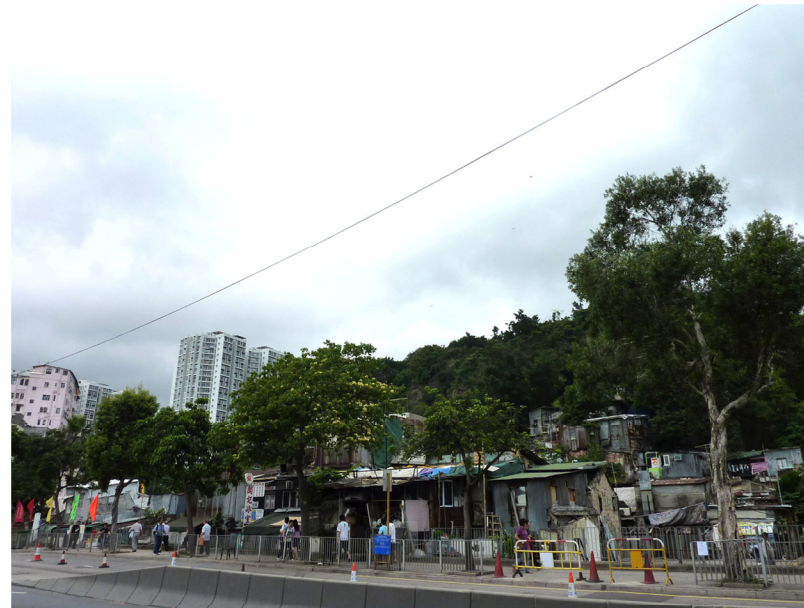
LR14 – Roadside Planting (Cha Kwo Ling Road)