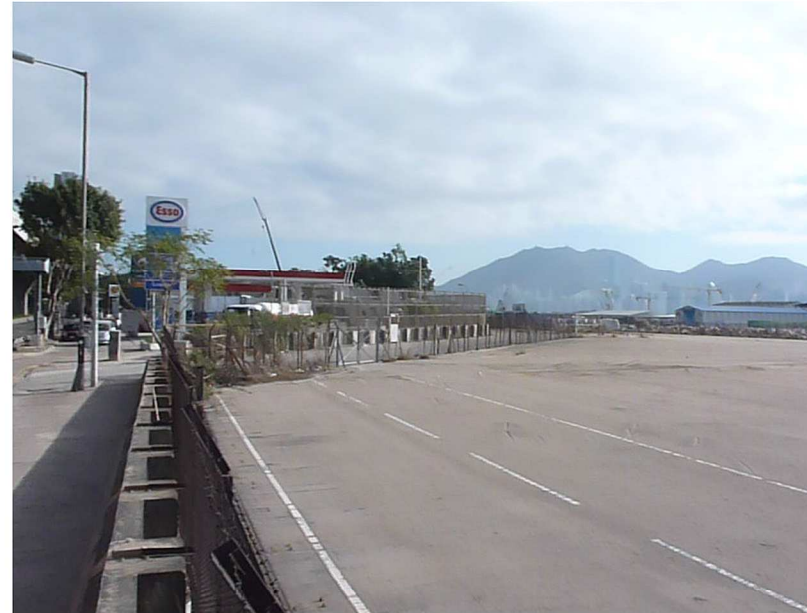
LR8 – Derelict / Disturbed Land (KTD South Apron)