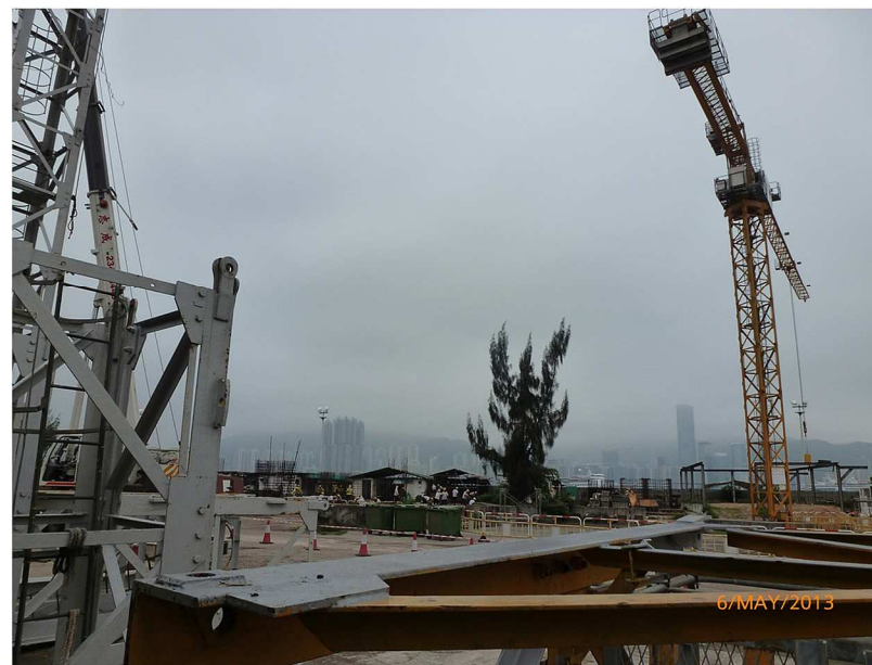
LR20 – Derelict / Disturbed Land Proposed as Cha Kwo Ling Promenade Park by Others (Wai Yip Street / Cha Kwo Ling Road Reclaimed Industrial Area)