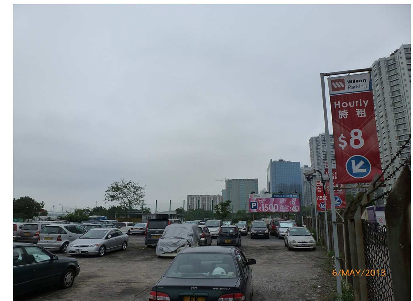
LR21 – Occupational Land (Wai Yip Street Car Park)