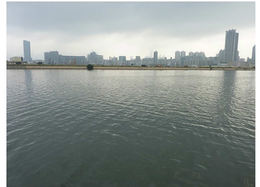
LR9 – Water Body (Kai Tak Approach Channel)