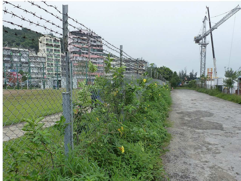
LR19 – Amenity Area and Access Road (Adjacent to Wai Lok Street Temporary Soccer Pitch)