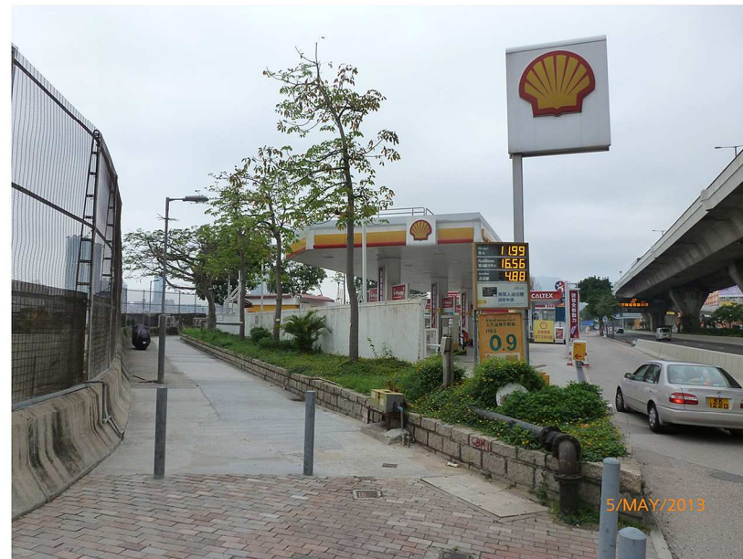
LR5 – Occupational Land (Kai Fuk Road Shell Garage)