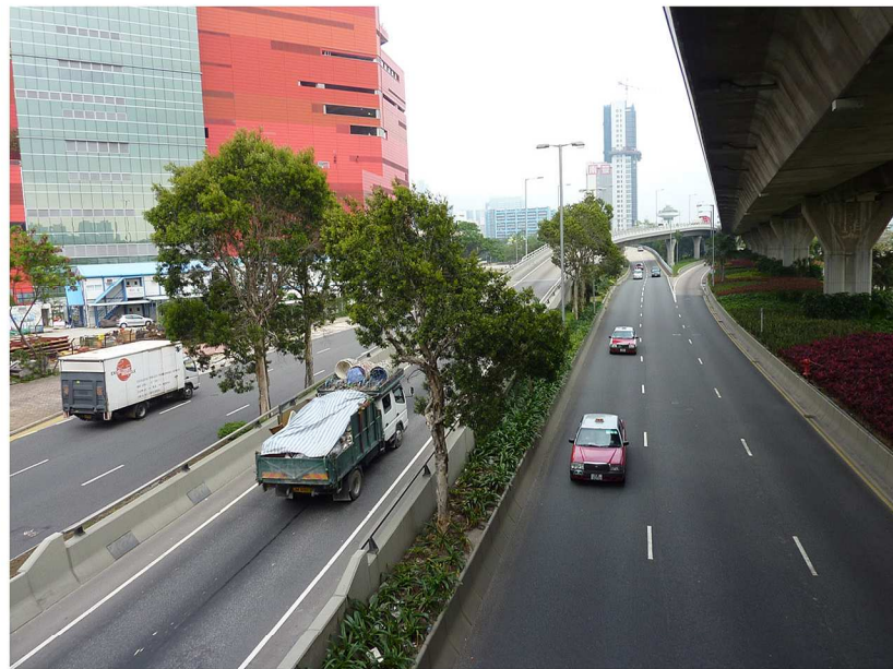
LR1 – Roadside Planting (Kai Fuk Road)