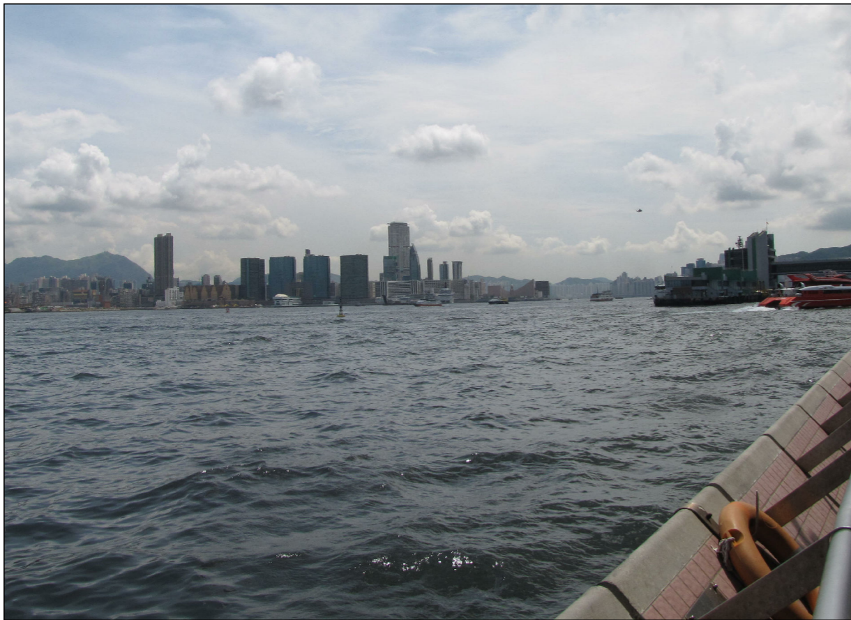
VSR 1 Sun Yat Sen Memorial Park