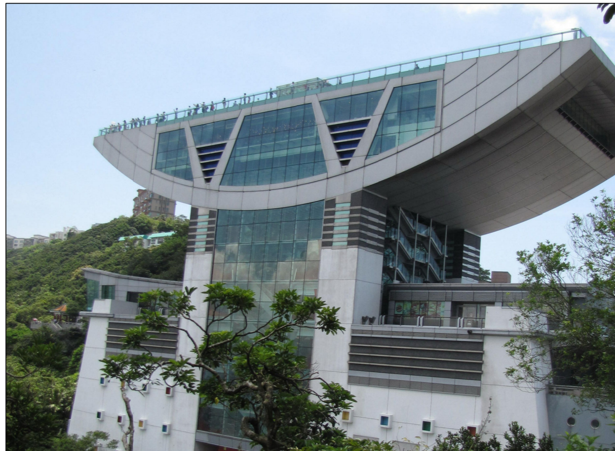
VSR 4 The Peak