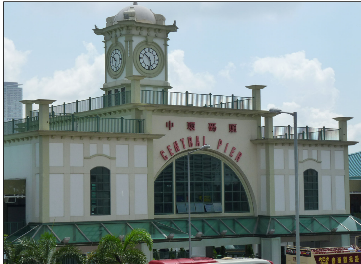
VSR 2 Central Star Ferry Pier No. 7