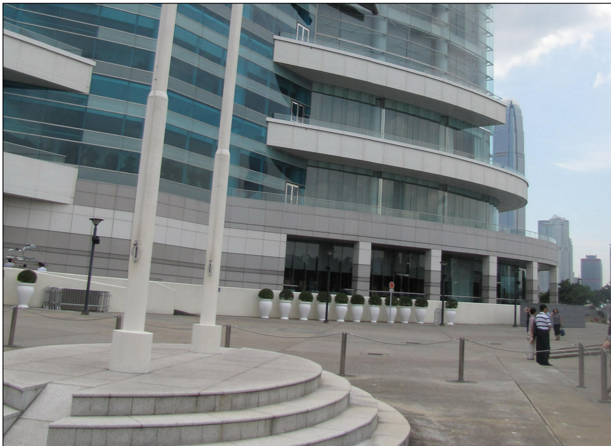
VSR 3 Hong Kong Convention and Exhibition Centre