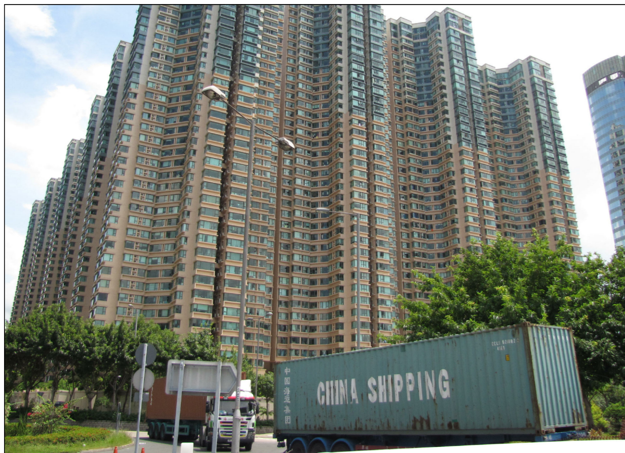
VSR 7 Island Harbourview