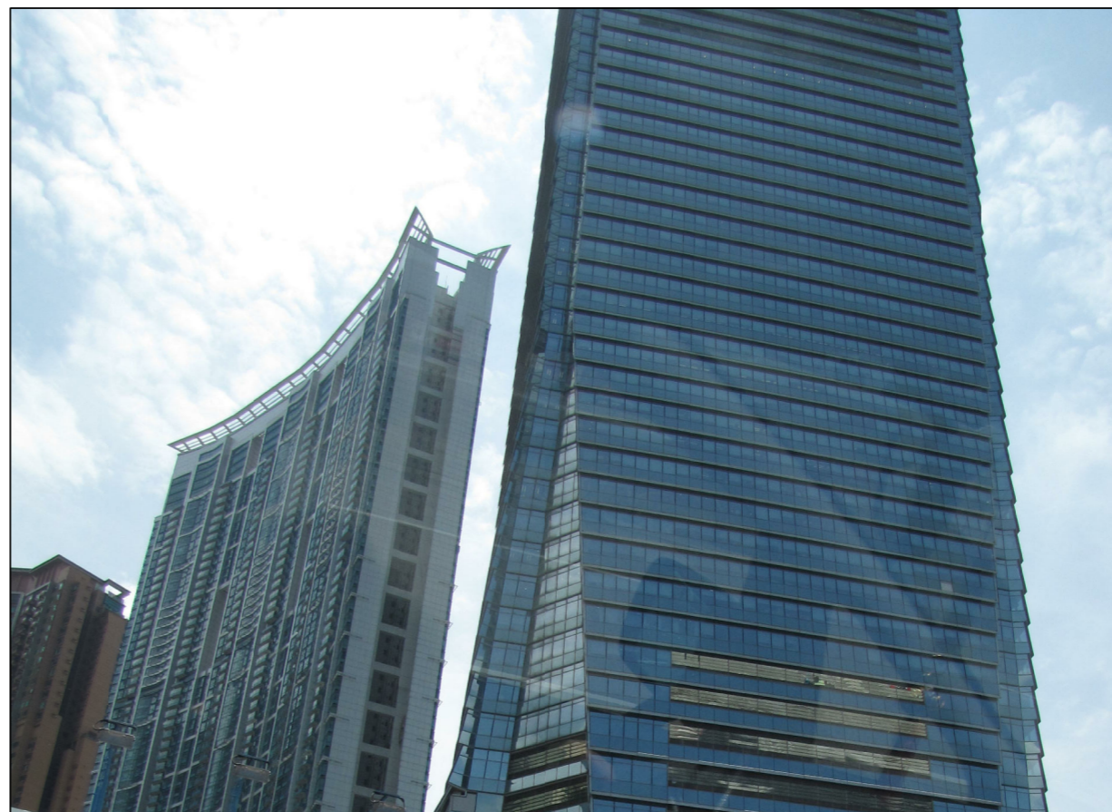
VSR 8 International Commerce Centre (ICC)