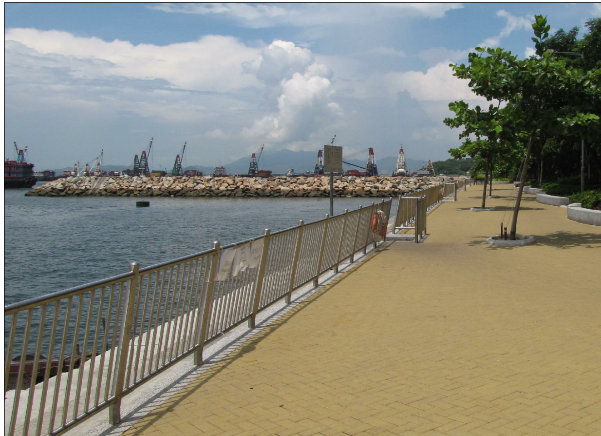
VSR 5 Hoi Fei Road Waterfront