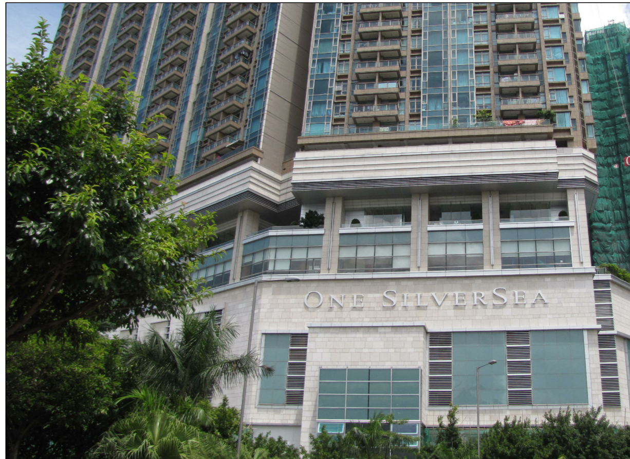
VSR 6 One Silversea