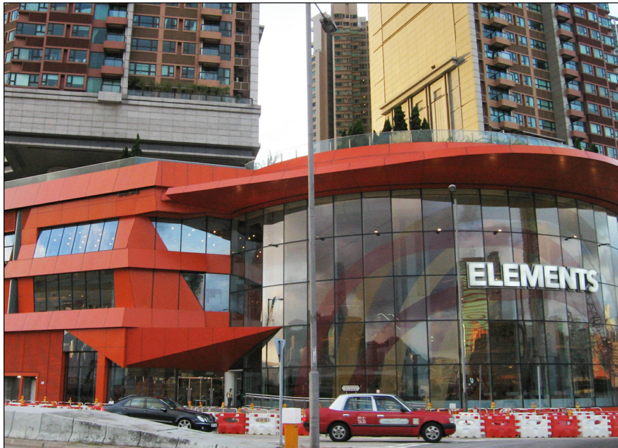
VSR 9 The Elements