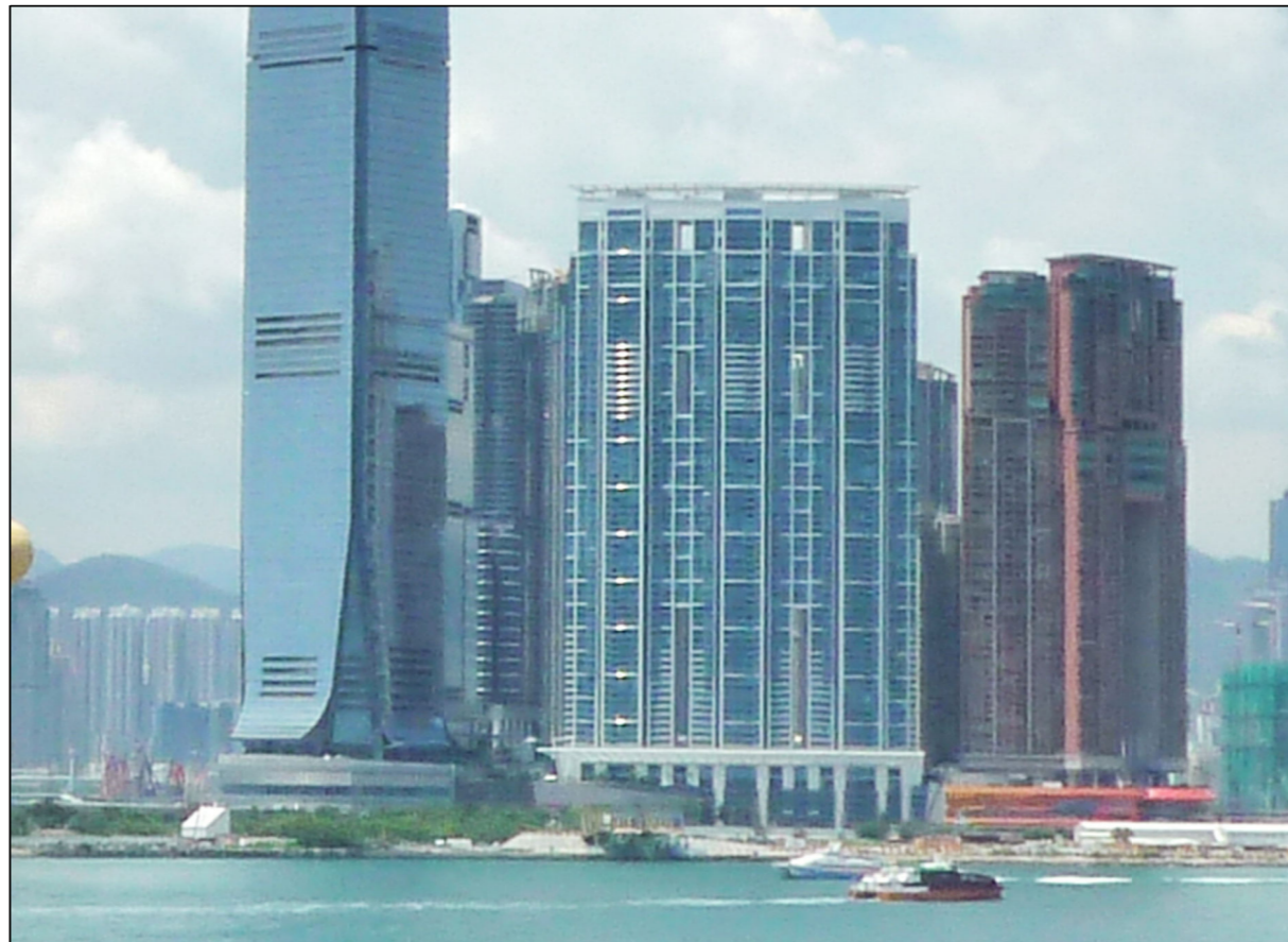
VSR 10 The Harbourside