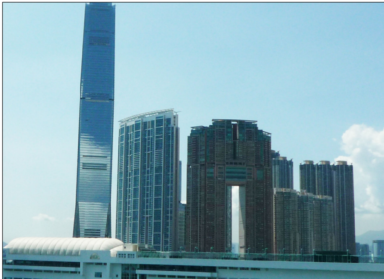
VSR 11 The Arch