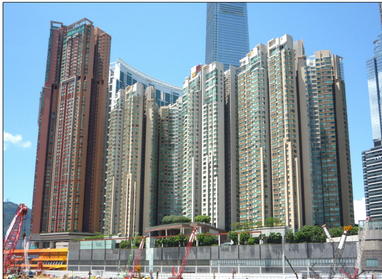
VSR 12 The Waterfront