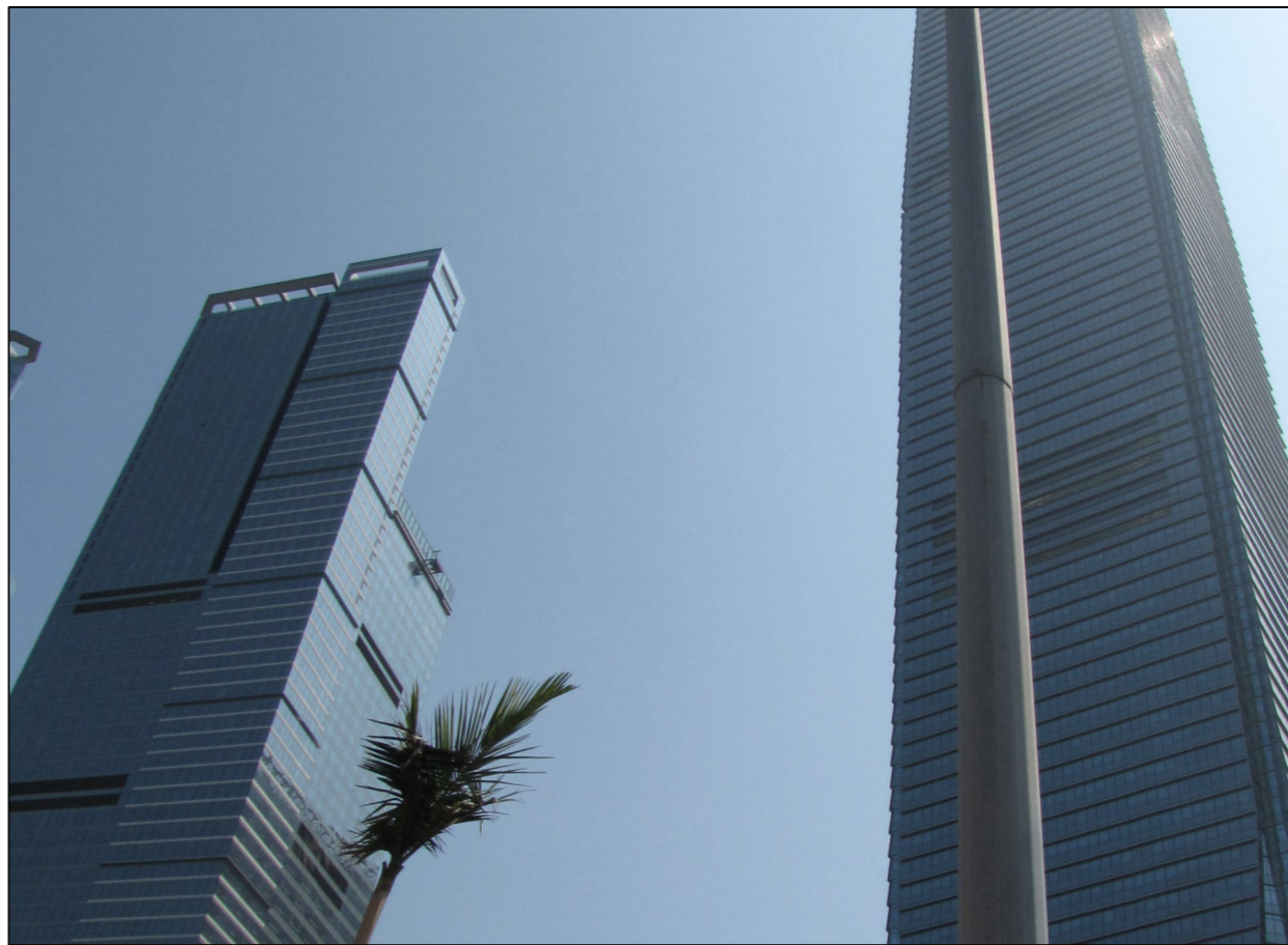
VSR 14 The Cullinan