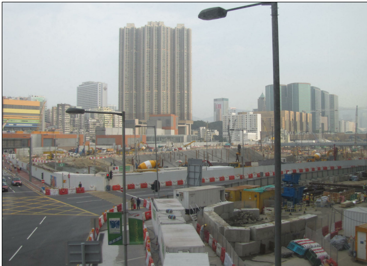
VSR 15 West Kowloon Terminus & VSR 16 Planned CDA Development above West Kowloon Terminus