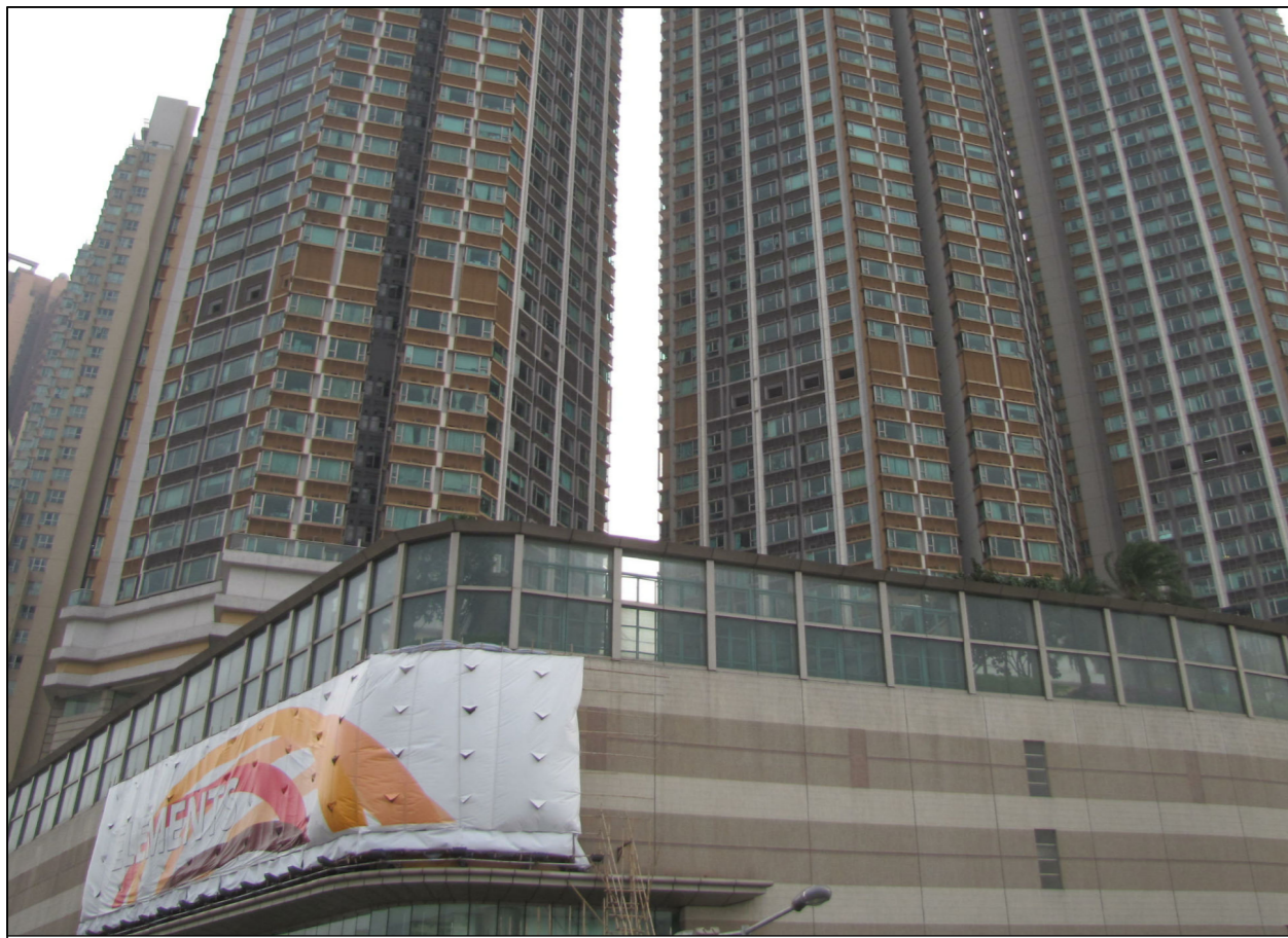
VSR 13 Sorrento Towers