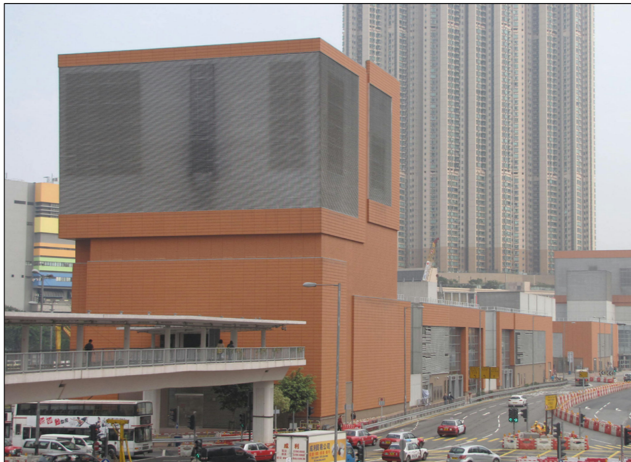
VSR 17 Austin Station