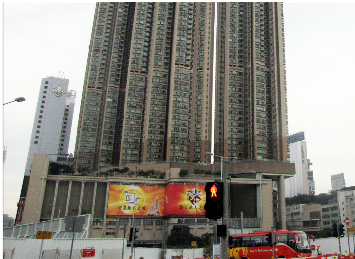
VSR 21 The Victoria Tower