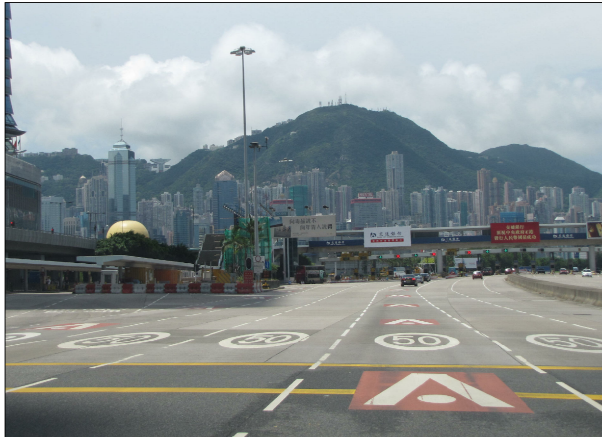
VSR 19 Western Harbour Crossing Toll Plaza