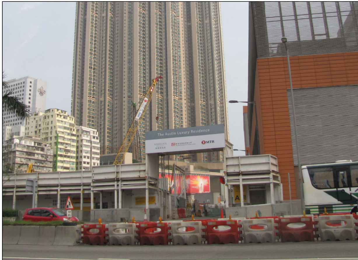
VSR 18 Planned Residential Development above Austin Station