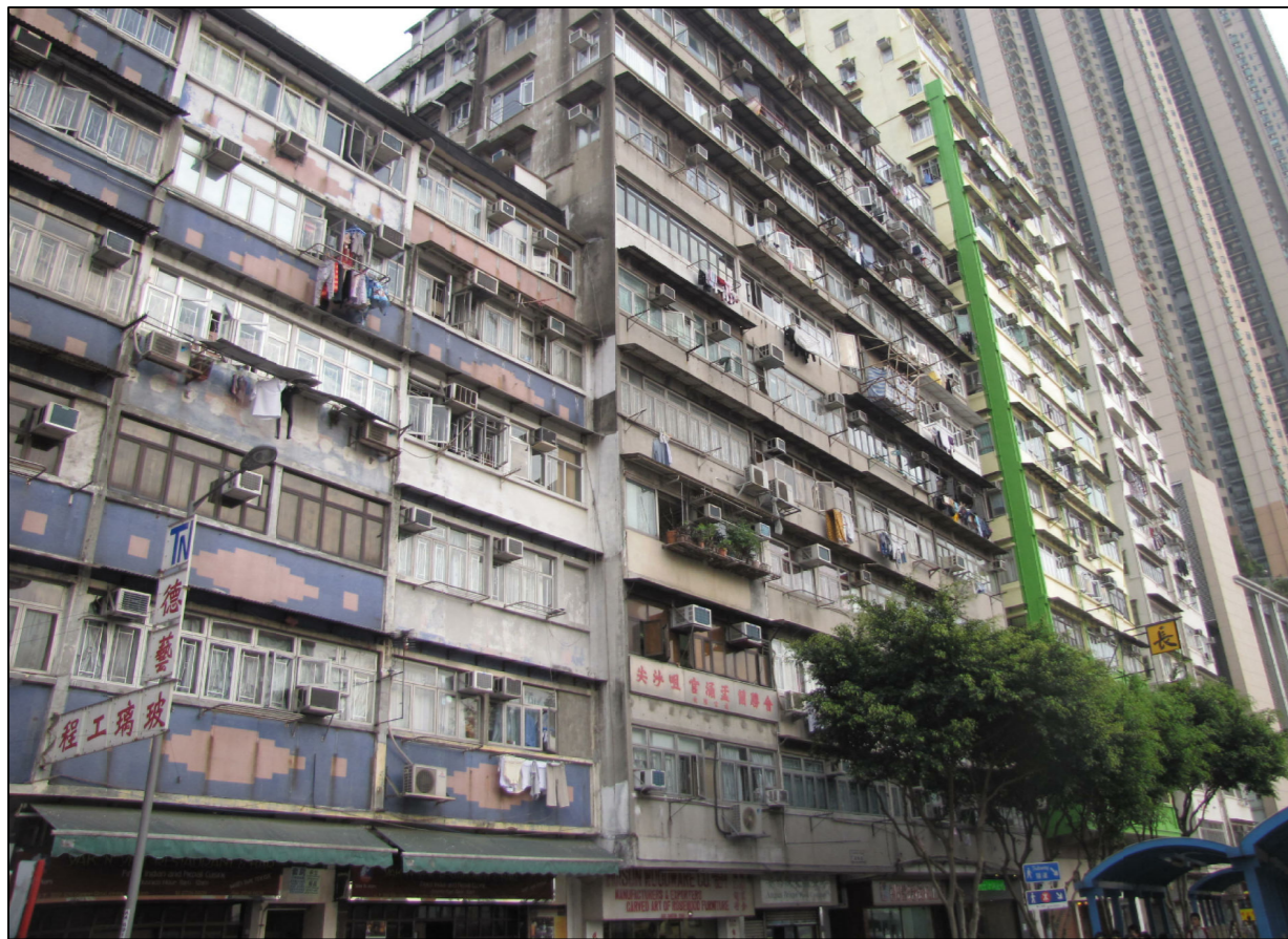
VSR 20 Wai On Building & Wai Hang Building