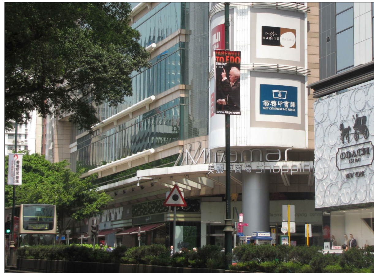
VSR 38 Miramar Arcade/ Tower and the Mira Hotel