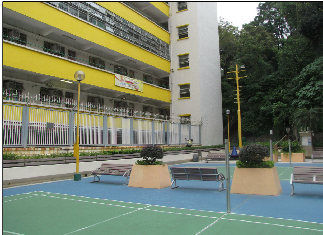
VSR 35 Kowloon Park (Entrance on Canton Road)