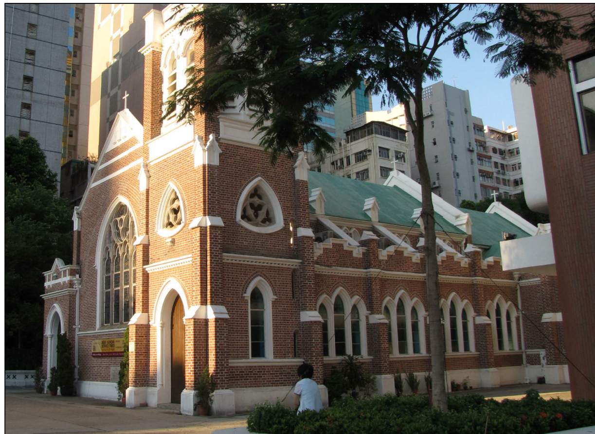
VSR 37 Heritage Sites Consisting of the Declared Monuments of St. Andrew's Church, Antiques and Monuments Office, and Hong Kong Observatory