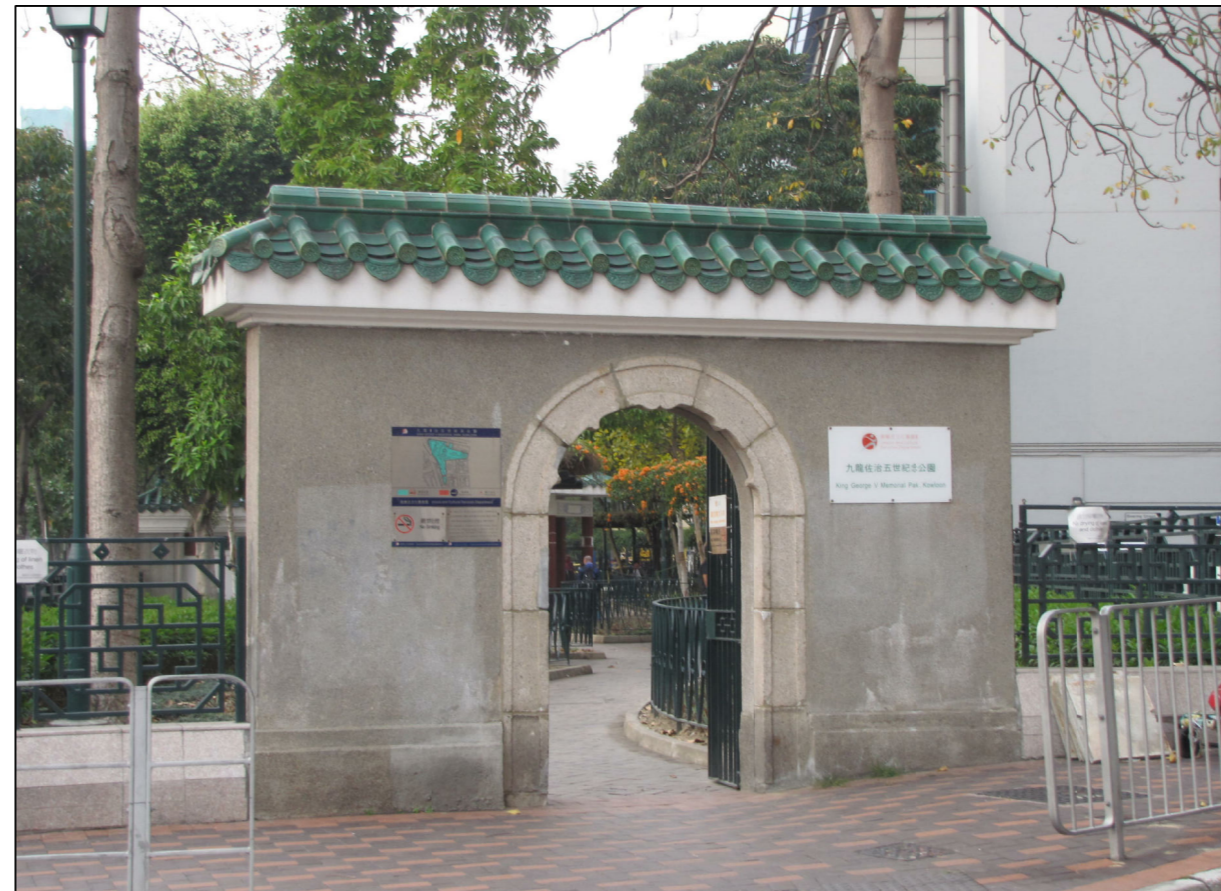
VSR 36 King George V Memorial Park, Kowloon