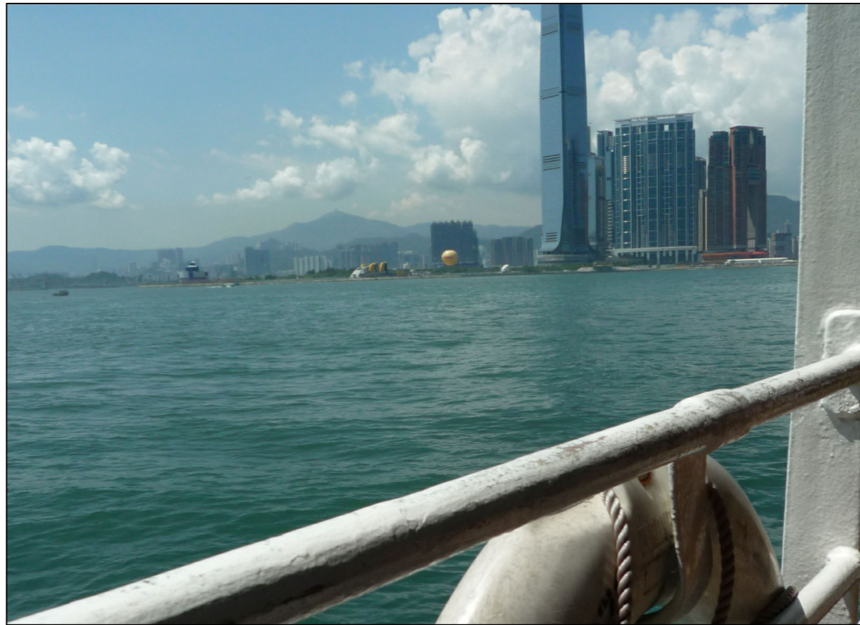
VSR 40 Travellers on Ferries to/from Central and Tsim Sha Tsui