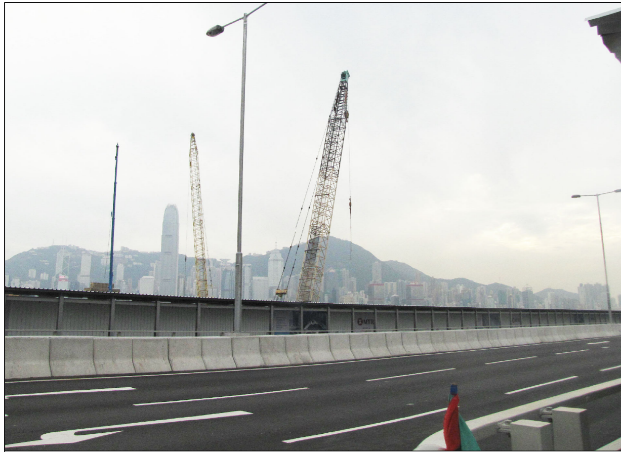
VSR 41 Travellers along Austin Road West