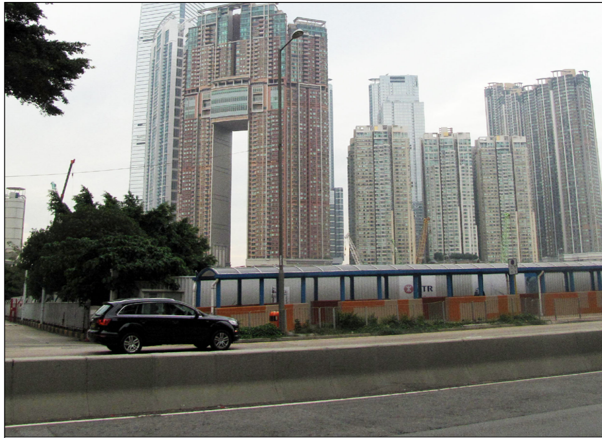
VSR 42 Travellers along Canton Road