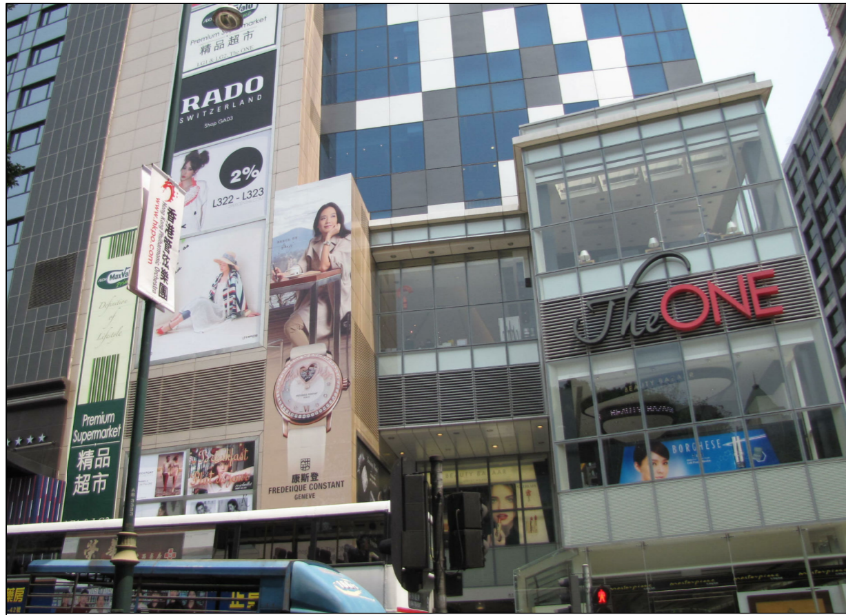
VSR 39 The One