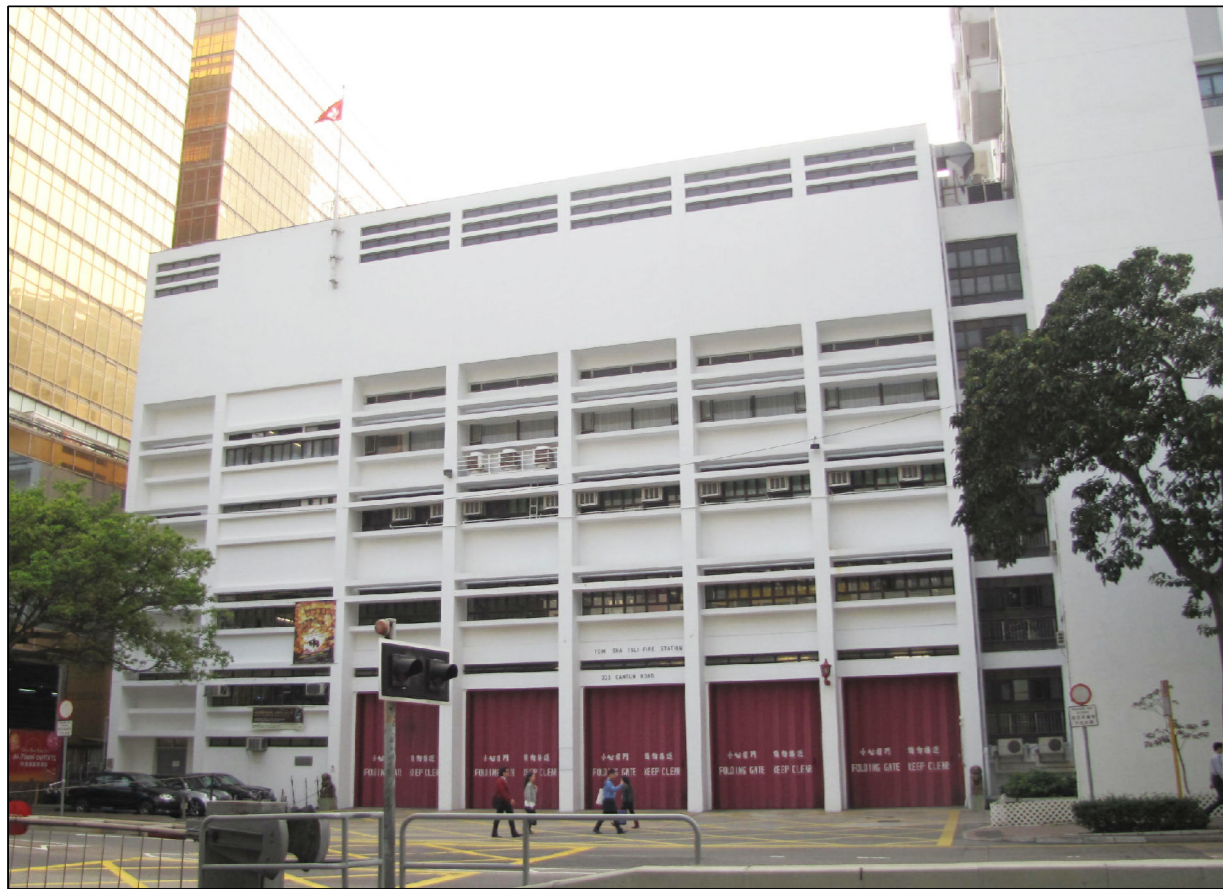
VSR 43 Tsim Sha Tsui Fire Station