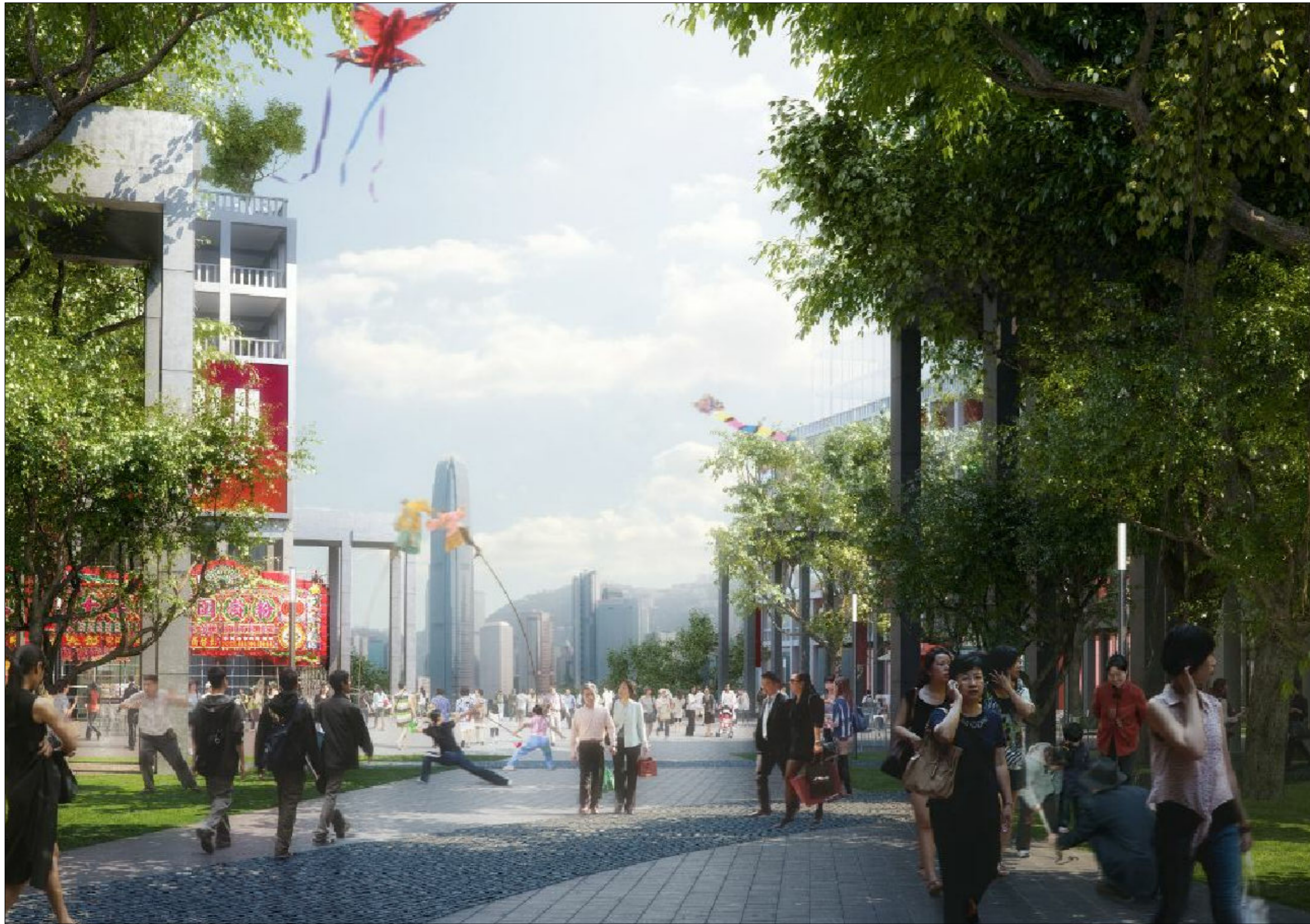
Notes: Indicative appearance from the WKCD Concept Plan.