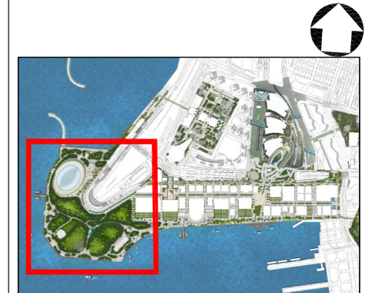
KEY PLAN 1:25,000M @A3