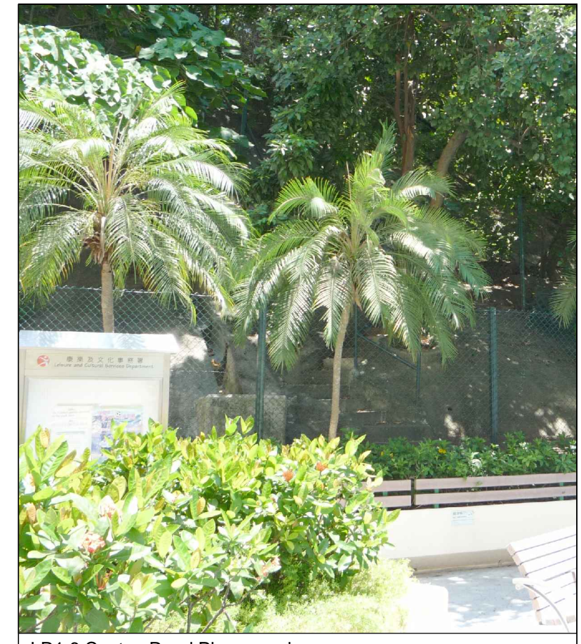
LR1.6 Canton Road Playground Photo 2