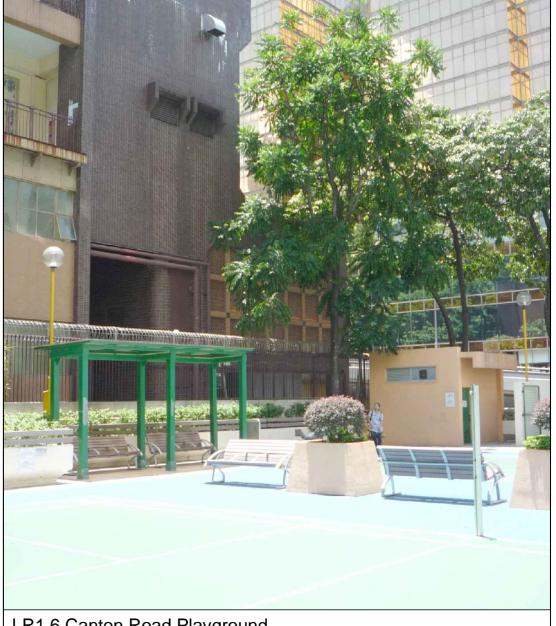
LR1.6 Canton Road Playground Photo 1