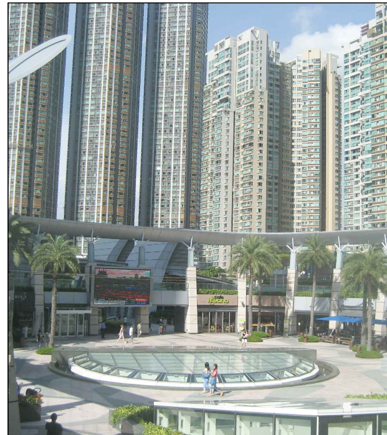
LR1.15 Public Open Space at the Kowloon Station Photo 1