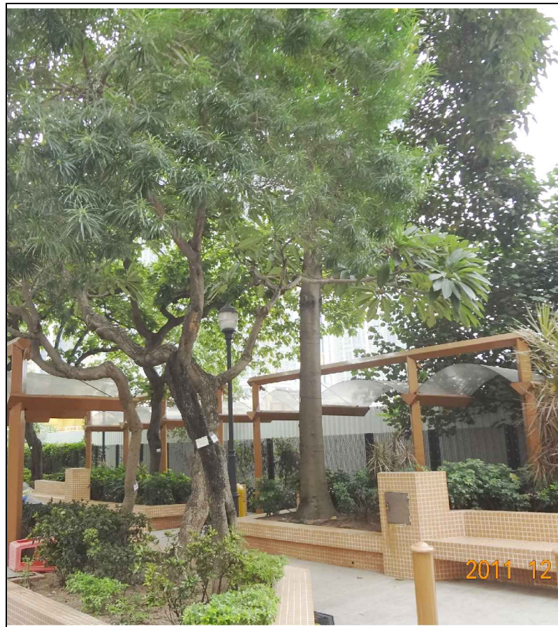
LR1.14 Man Cheong Street Rest Garden Photo 1