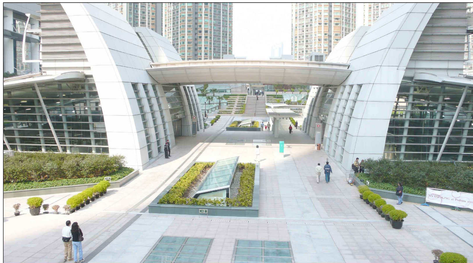
LR1.15 Public Open Space at the podium of Kowloon Station Photo 2