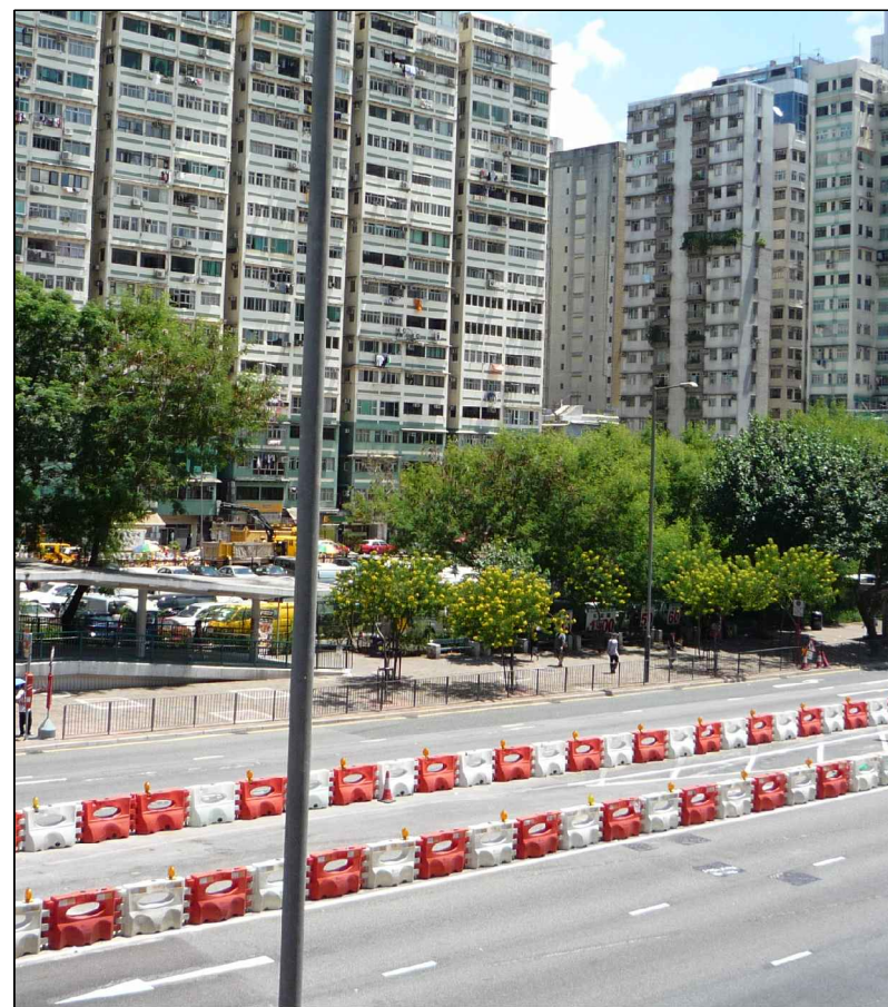
LR2.17 Roadside Plantation close to Jordan Road and Ferry Street Carpark Photo 1