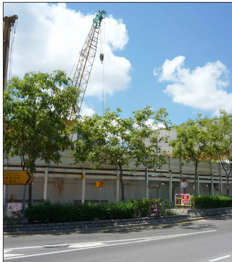
LR2.15 Roadside Plantation along Wui Cheung Road Photo 2