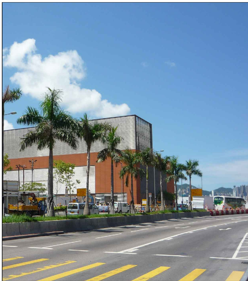
LR2.15 Roadside Plantation along Wui Cheung Road Photo 1