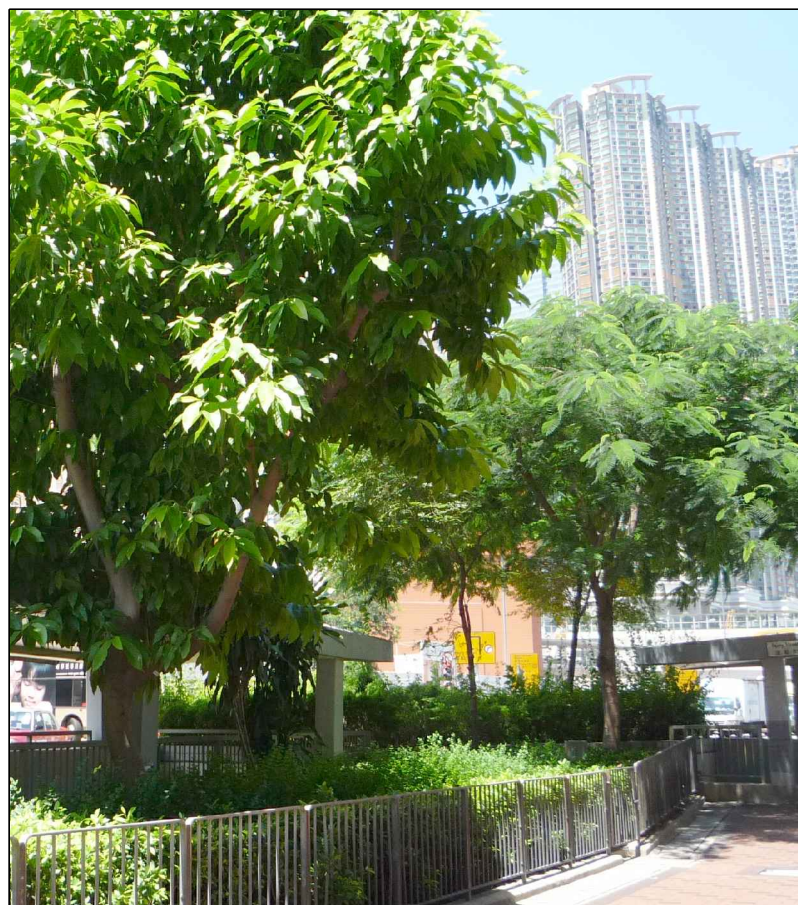
LR2.16 Roadside Plantation along Jordan Road Photo 2