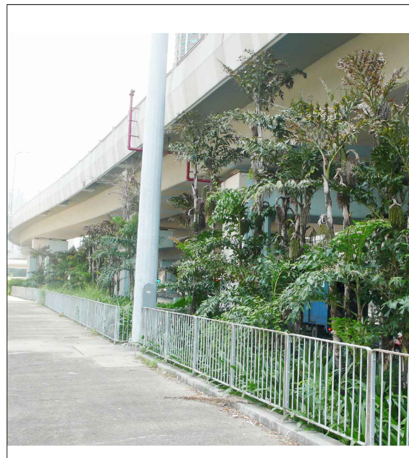
LR2.28 Roadside Plantation along Western Harbour Crossing Bus Stop near Element Photo 3