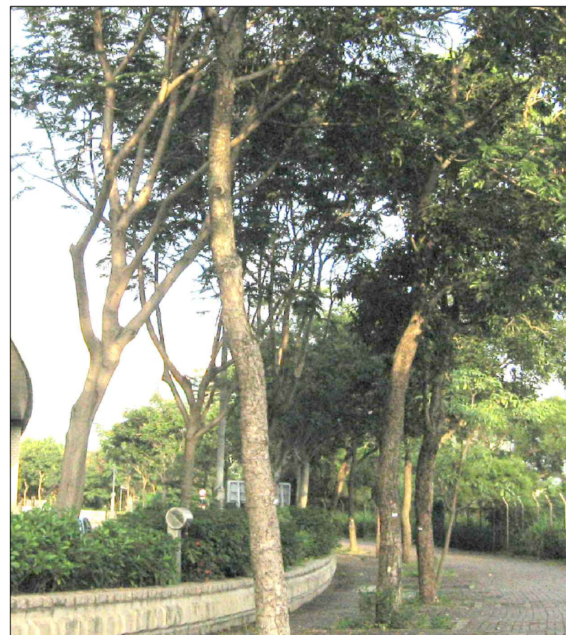
LR2.29 Roadside Plantation along Austin Road West Photo 2