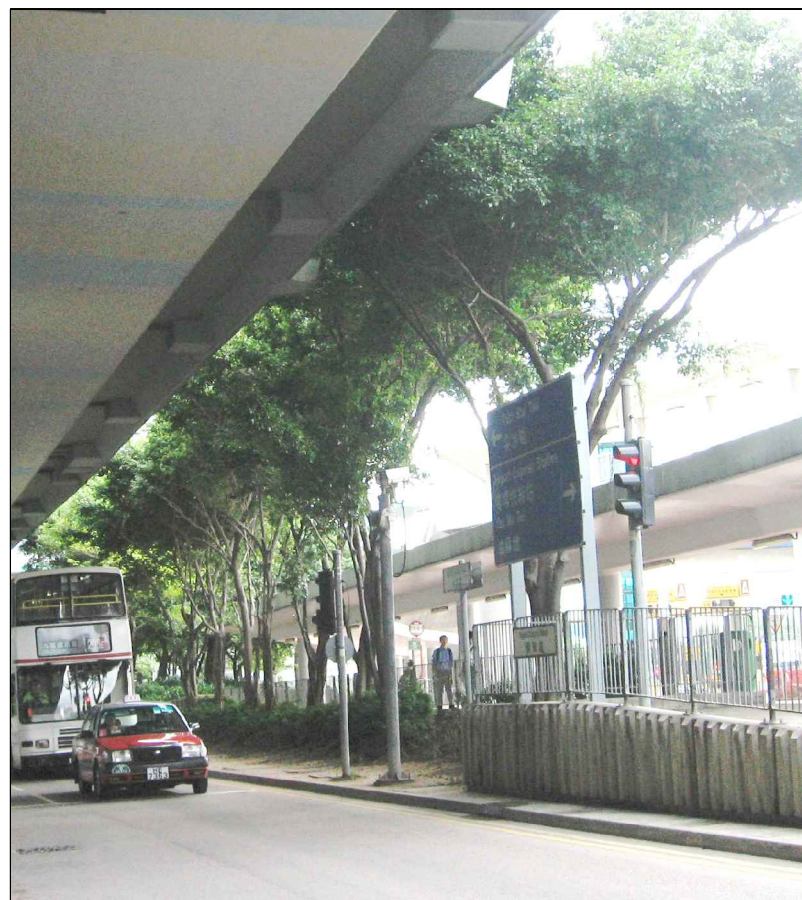
LR2.28 Roadside Plantation along Western Harbour Crossing Bus Stop near Element Photo 1