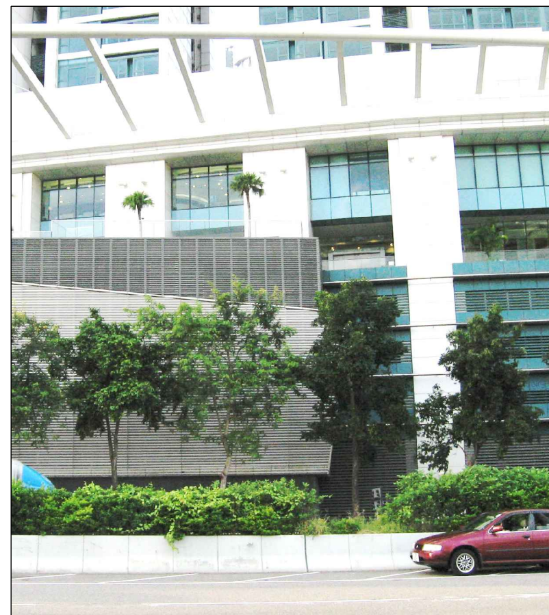
LR2.29 Roadside Plantation along Austin Road West Photo 3