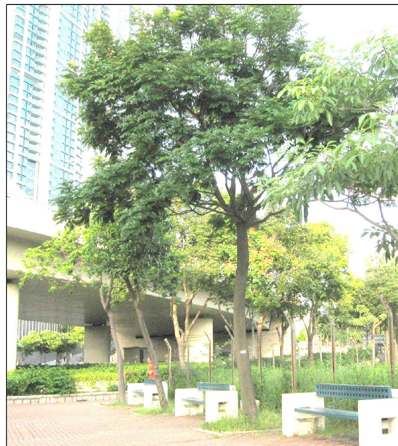
LR2.29 Roadside Plantation along Austin Road West Photo 1