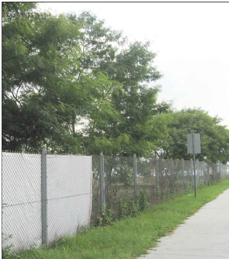
LR2.35 Tree Cluster in the Western Part within the Site Boundary Photo 1