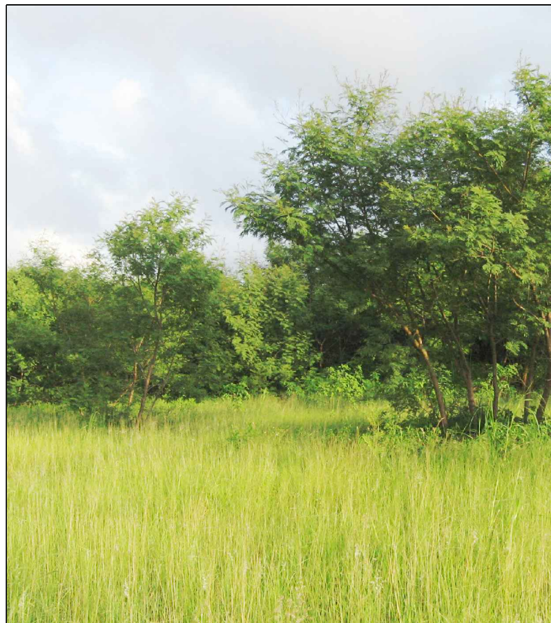
LR2.36 Tree Cluster in the Eastern Part within the Site Boundary Photo 2