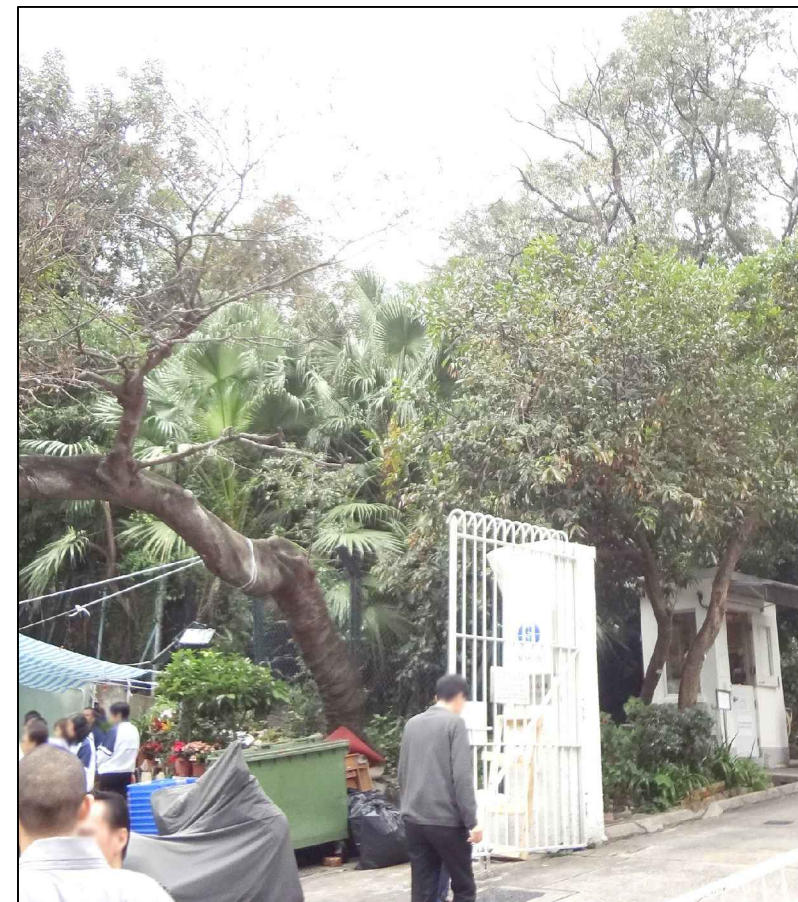
LR2.38 Amenity Planting next to Hong Kong Observatory Building Photo 1