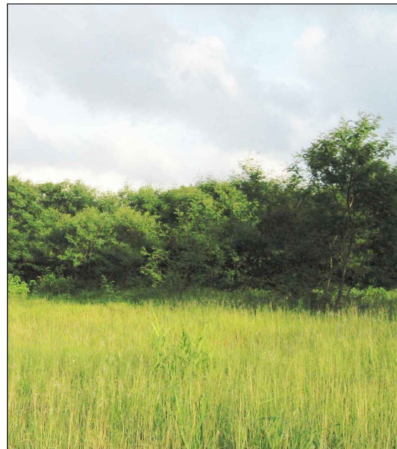
LR2.36 Tree Cluster in the Eastern Part within the Site Boundary Photo 1