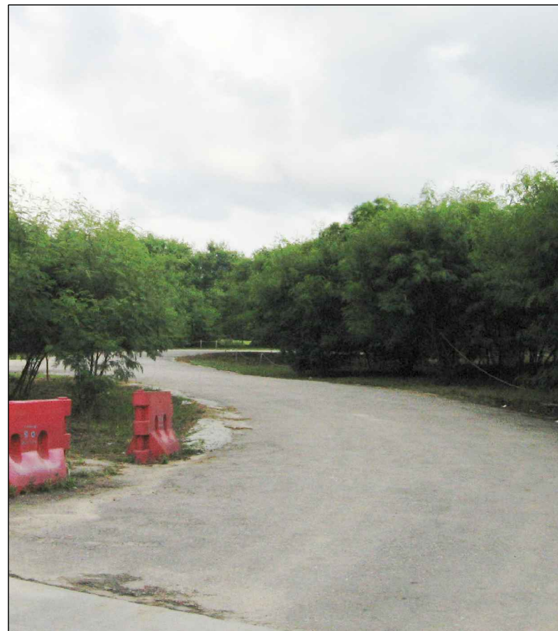
LR2.35 Tree Cluster in the Western Part within the Site Boundary Photo 2