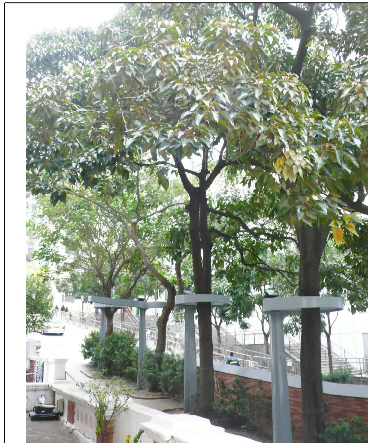
LR4.2 St. Andrew's Church and Former Kowloon British School Photo 5 - Trees Outside the Former Kowloon British School