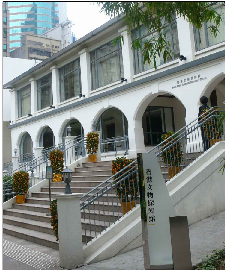
LR4.4 Built Heritage within Kowloon Park Photo 1 - Hong Kong Heritage Discovery Centre