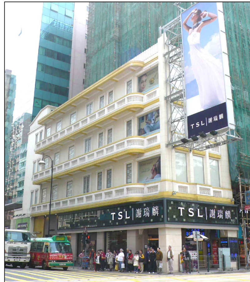
LR4.3 No. 190 Nathan Road Photo 2