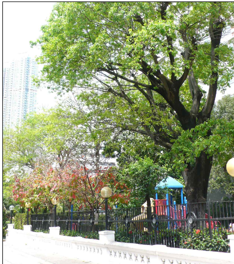
LR4.2 St. Andrew's Church and Former Kowloon British School Photo 3