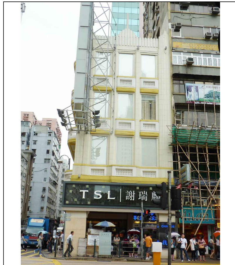
LR4.3 No. 190 Nathan Road Photo 1