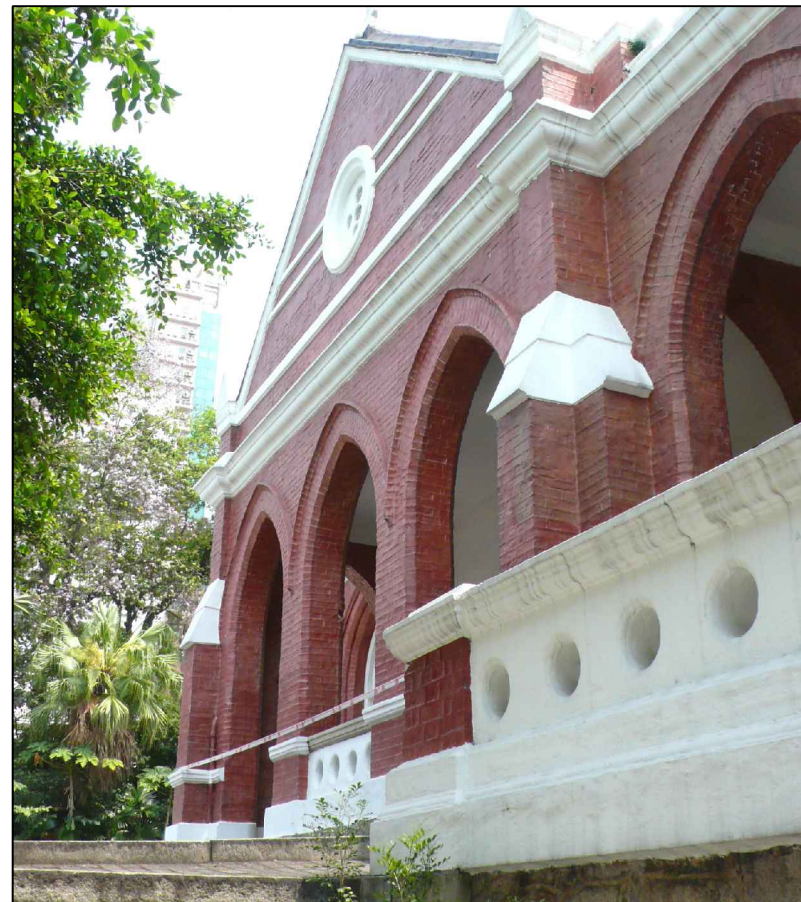
LR4.2 St. Andrew's Church and Former Kowloon British School Photo 4 - Former Kowloon British School