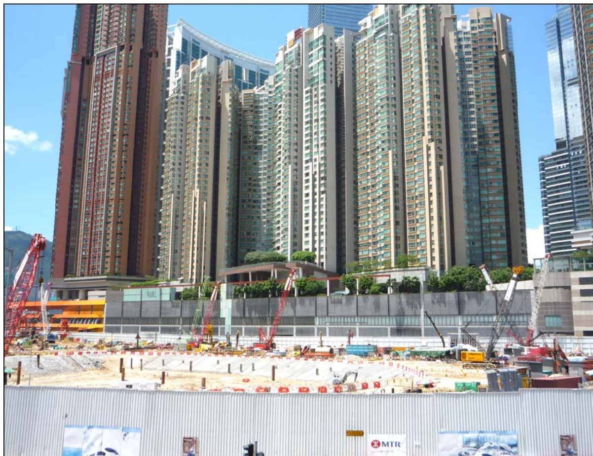
Photo VC20 (LCA10) Guangzhou-Shenzhen-Hong Kong Express Rail Link Terminus Construction Site & Austin Station