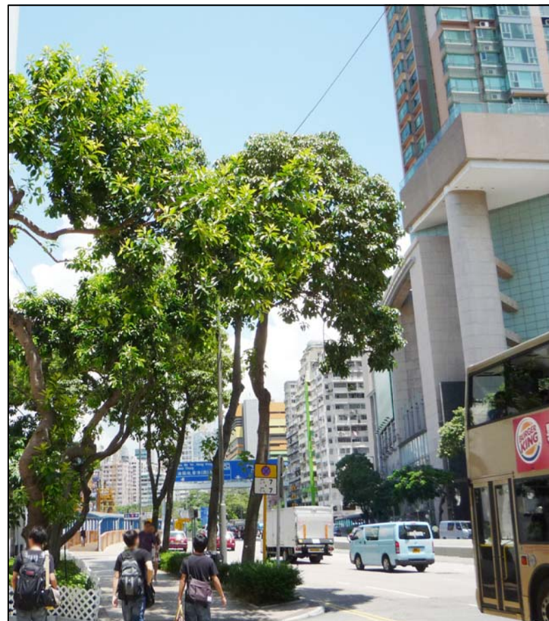
LR2.9 Roadside Plantation in front of Tsim Sha Tsui Fire Station Photo 1