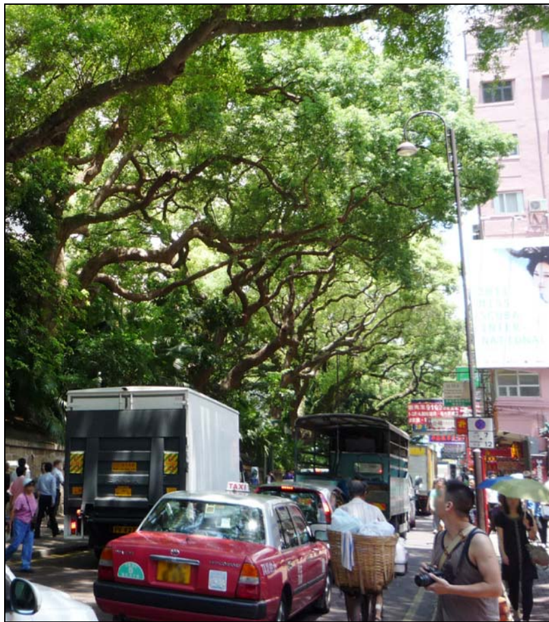
LR2.6 Roadside Plantation along Haiphong Road Photo 1