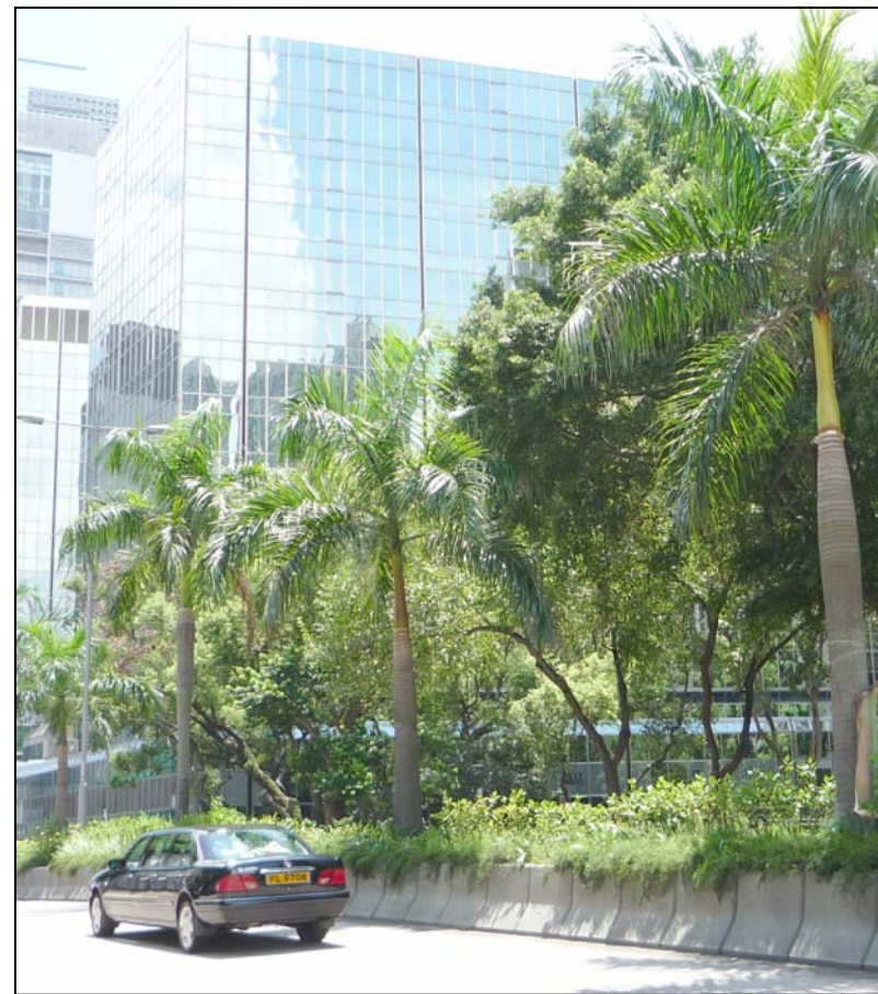
LR2.7 Amenity Planting Strip along Kowloon Park Drive Photo 1