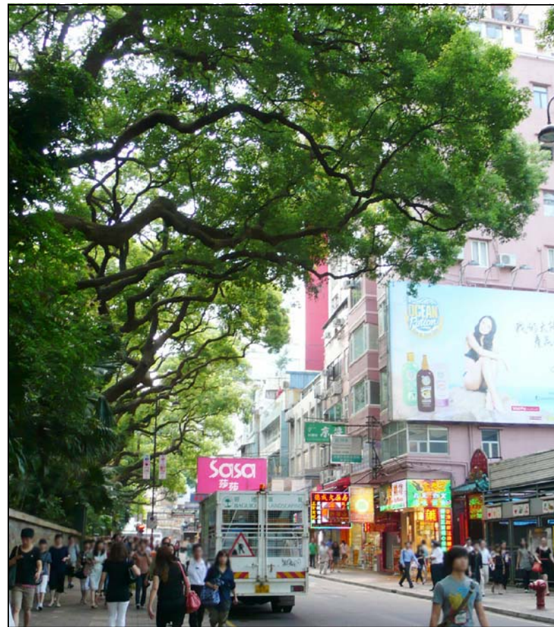
LR2.6 Roadside Plantation along Haiphong Road Photo 2