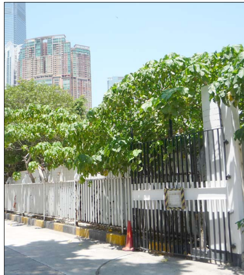
LR2.9 Roadside Plantation in front of Tsim Sha Tsui Fire Station Photo 2