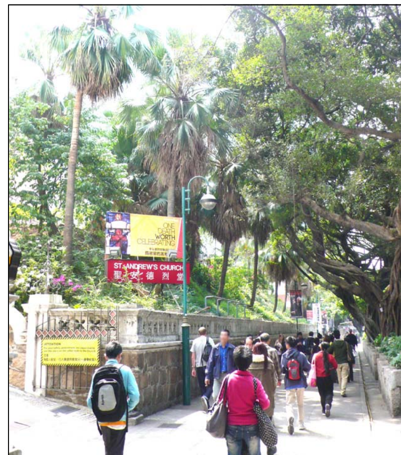
LR4.2 St. Andrew's Church and Former Kowloon British School Photo 1