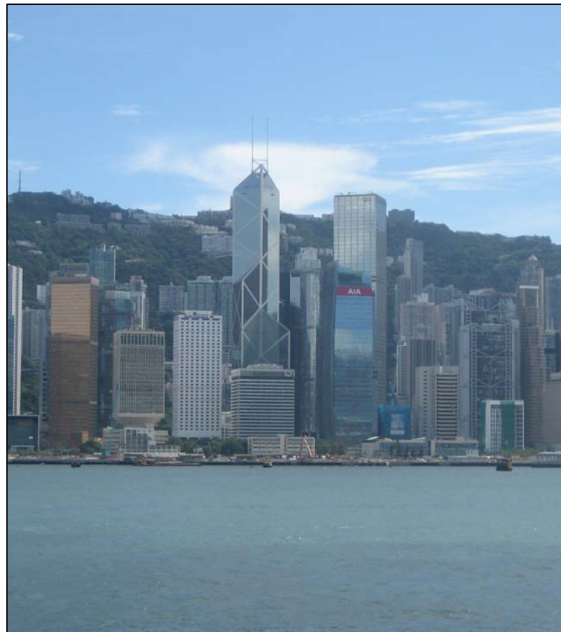
LR3.1 Victoria Harbour Photo 2