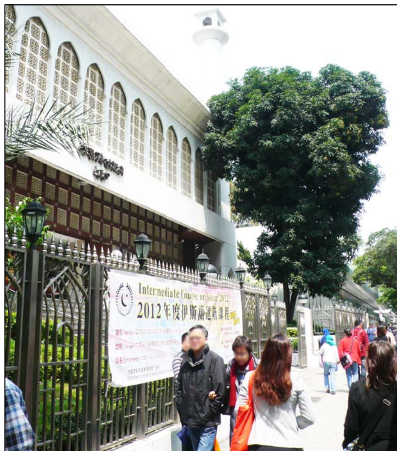
LR4.1 Kowloon Mosque and Islamic Centre Photo 2