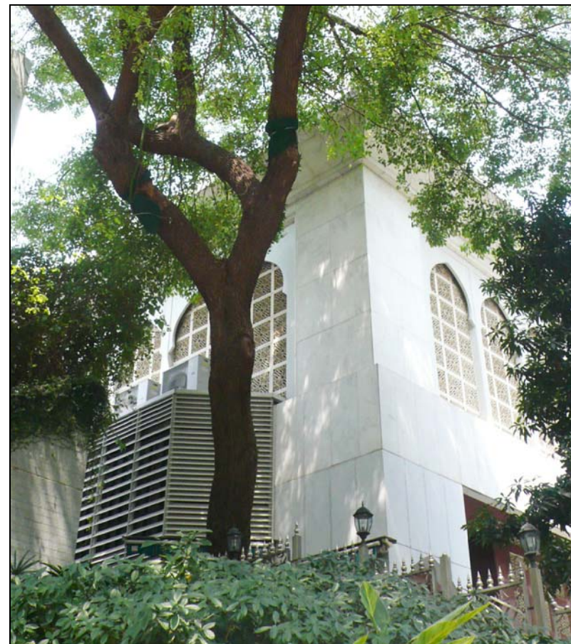
LR4.1 Kowloon Mosque and Islamic Centre Photo 1