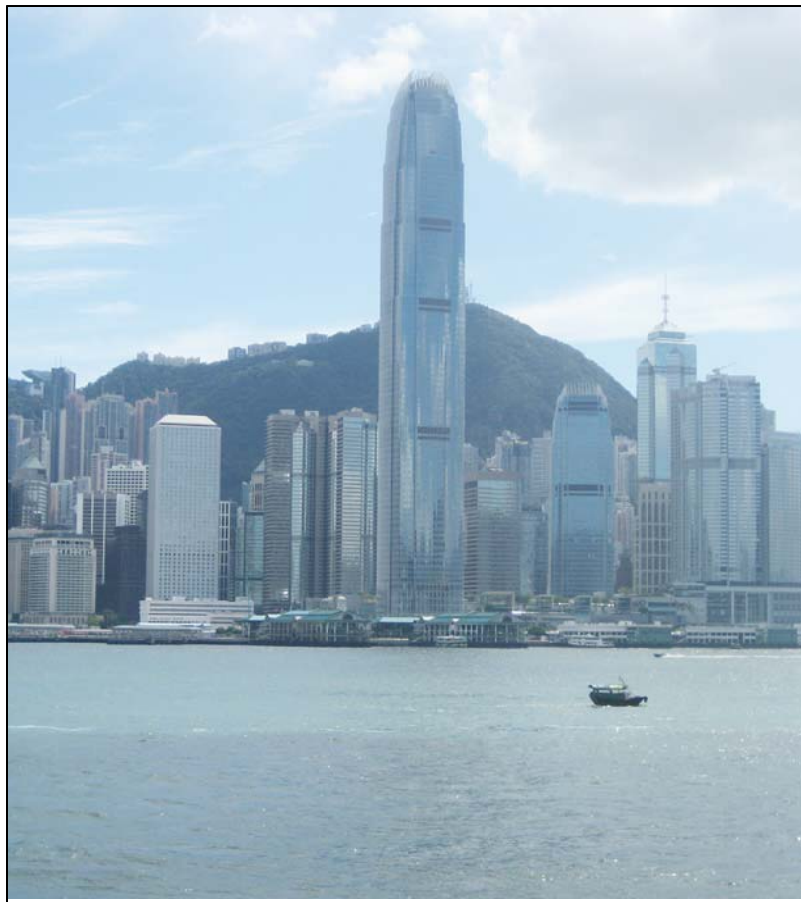
LR3.1 Victoria Harbour Photo 1