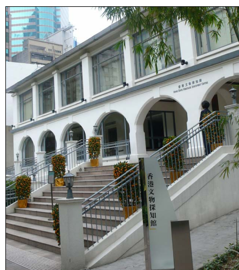
LR4.4 Built Heritage within Kowloon Park Photo 1 - Hong Kong Heritage Discovery Centre