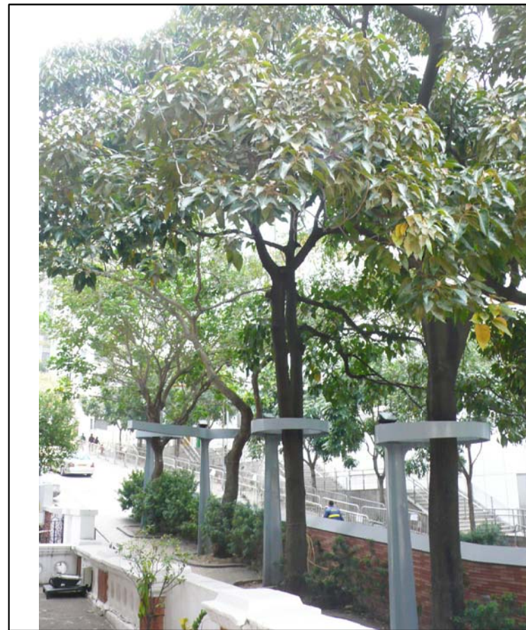
LR4.2 St. Andrew's Church and Former Kowloon British School Photo 5 - Trees Outside the Former Kowloon British School