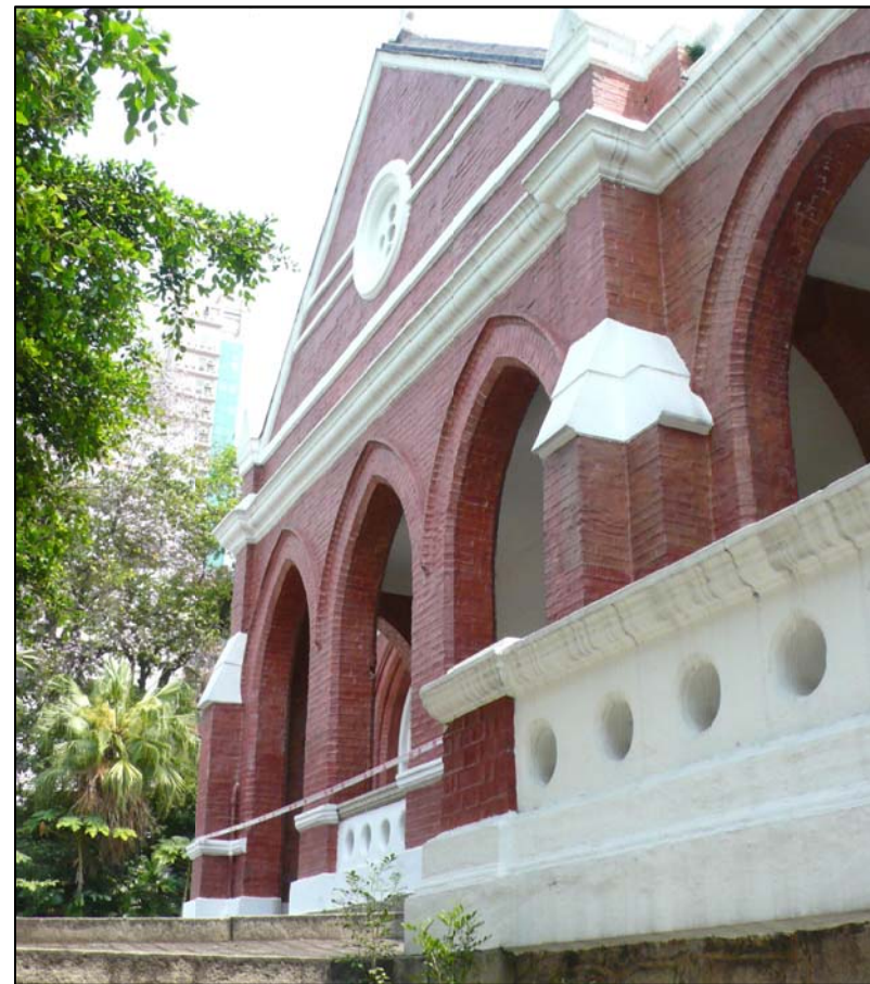
LR4.2 St. Andrew's Church and Former Kowloon British School Photo 4 - Former Kowloon British School