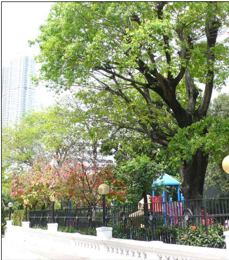
LR4.2 St. Andrew's Church and Former Kowloon British School Photo 3