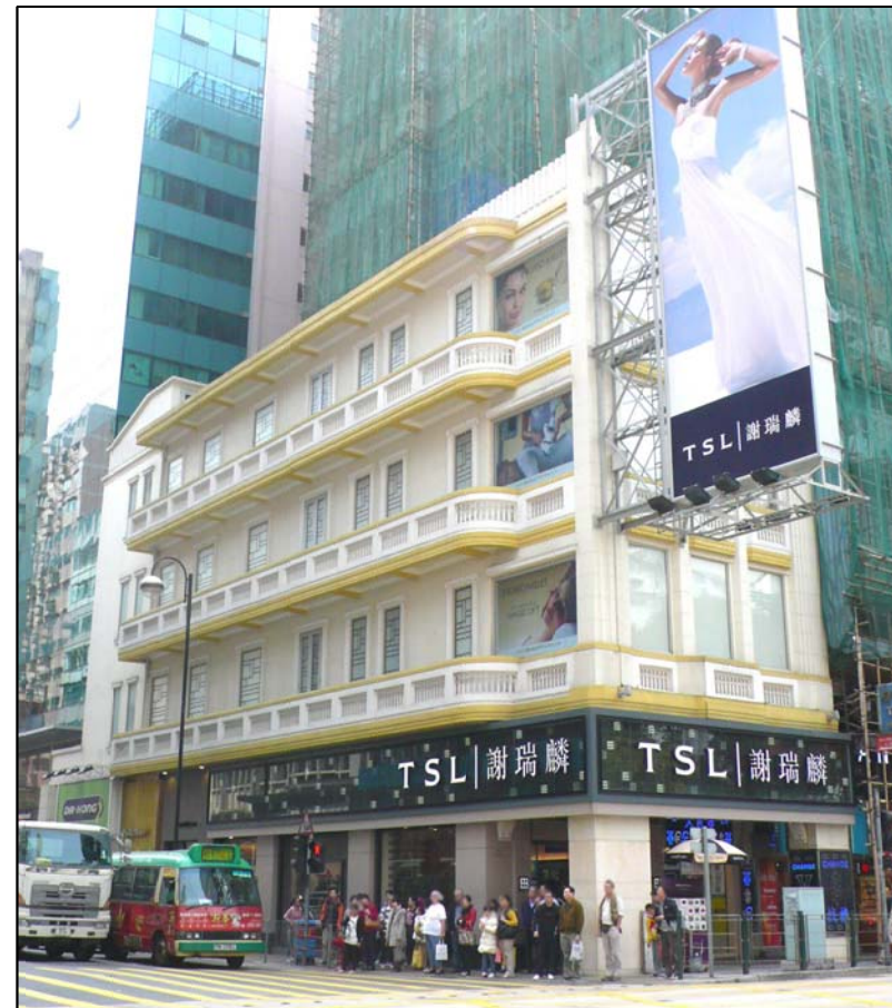
LR4.3 No. 190 Nathan Road Photo 2