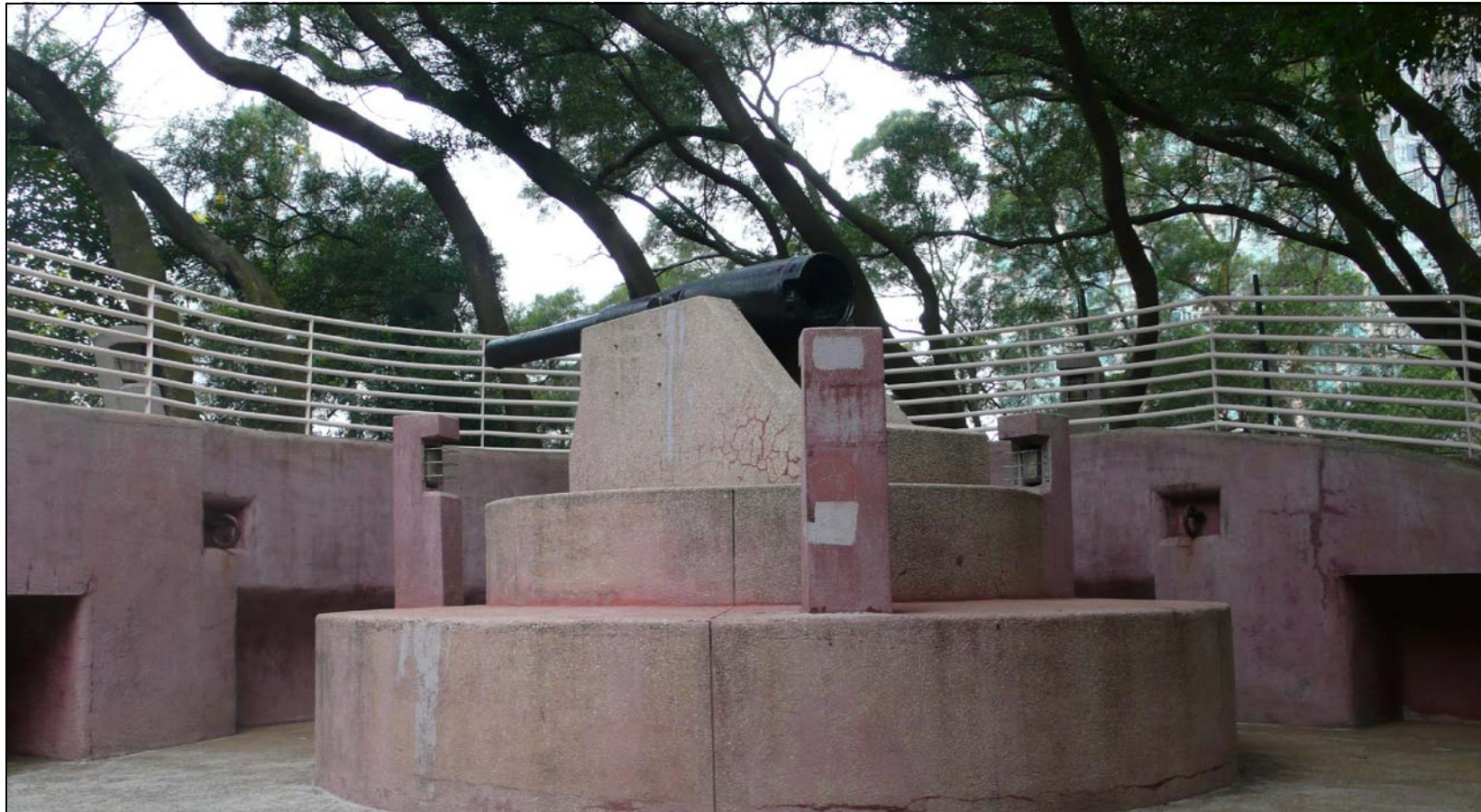
LR4.4 Built Heritage within Kowloon Park Photo 3 - Kowloon West II Battery