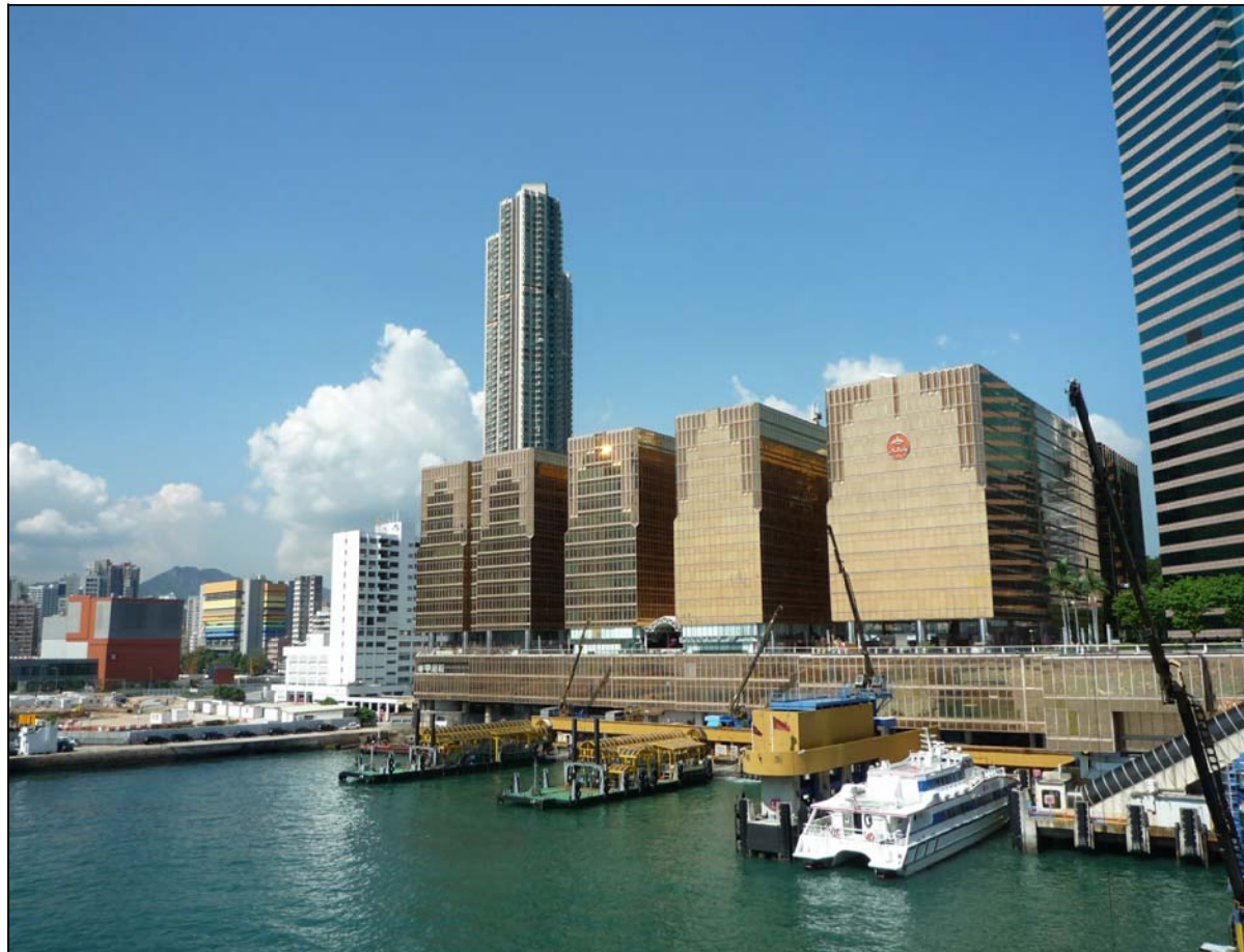
Photo VC30 (LCA14) Tsim Sha Tsui Commercial/Retail Complex Landscape