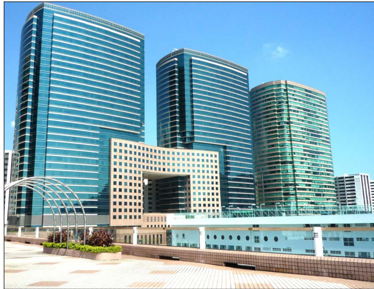
Photo VC29 (LCA14) Tsim Sha Tsui Commercial/Retail Complex Landscape